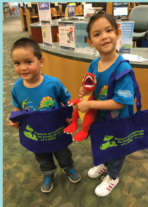
Two 1,000 Books Before Kindergarten finishers at Central Park Library!

Ready to get started? Pick up a starter packet at the library or print your first log sheets at sclibrary.org/1000-books . Celebrate your child's success by collecting a milestone sticker at the library after every 100 books you read. Families who complete all 1,000 books before their child enters school will earn a special prize!