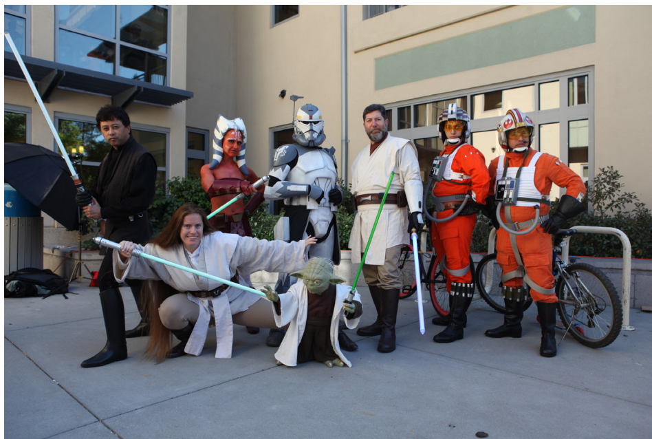
Cosplayers pose in front of Central Park Library at the 2016 Comic Con event. Which of your favorite characters will attend this year? Come on October 7 to find out!