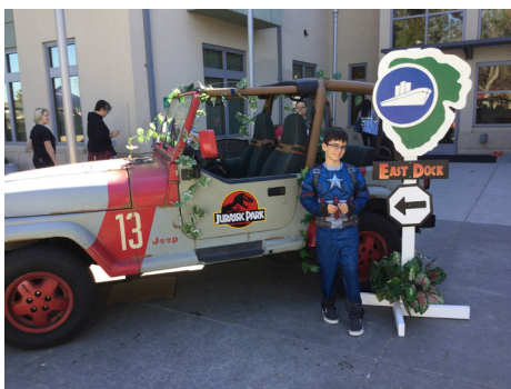
A costumed library patron poses with last year's Jurassic Jeep.