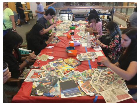
Adult attendees craft their own glasses at Comic Con.