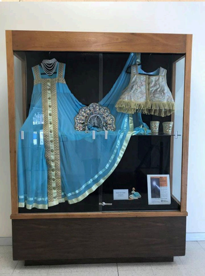
West Wing Tatiana Elliston – Russian Swan Costume

This artwork was made from the hood of a 1987 Honda Civic. Pieces of the metal were cut out using a plasma cutter. Behind the cutouts, an LED light phased through multiple colors (green, red and blue) which was amplified by the white poster-board mounted behind the Phoenix.