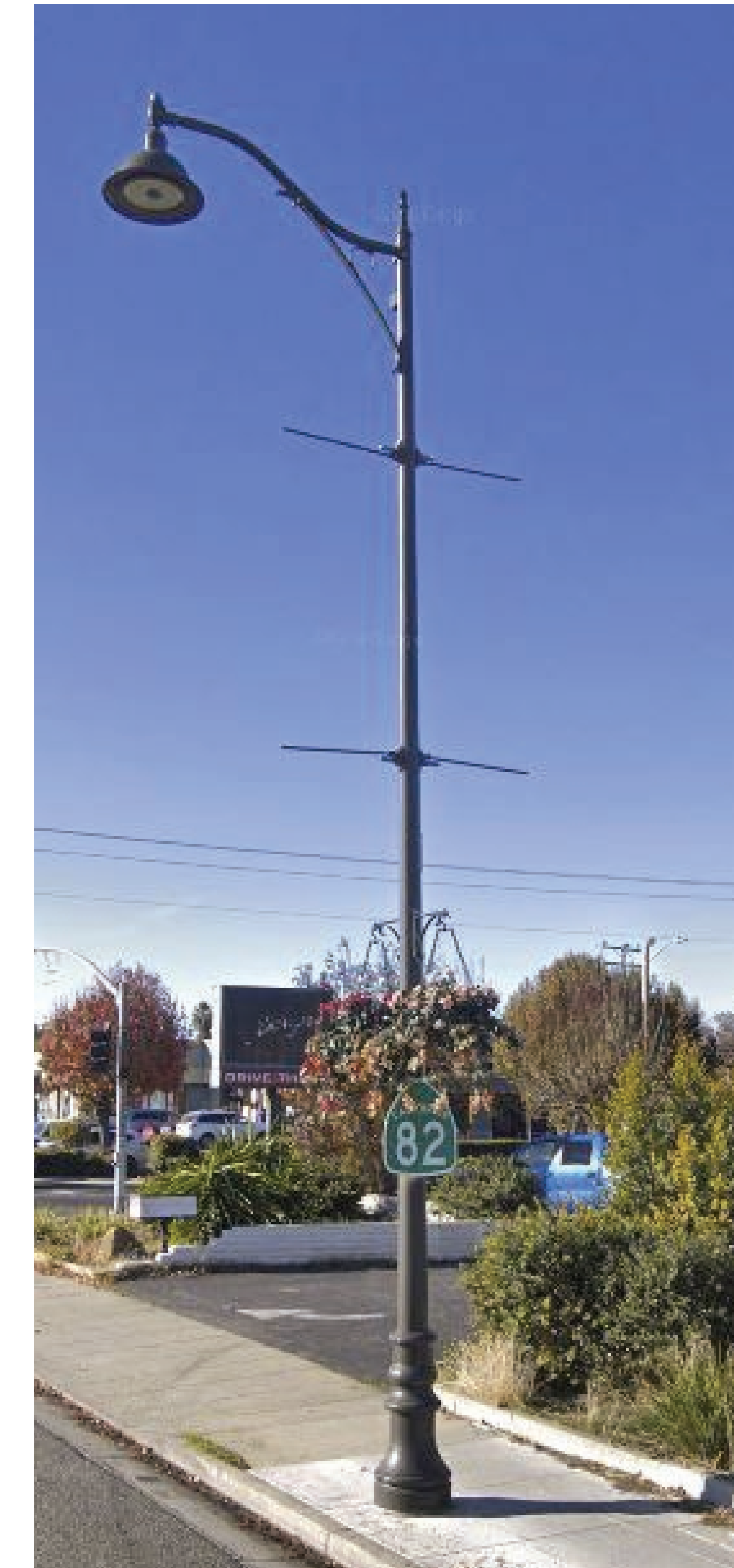
Existing ECR light pole