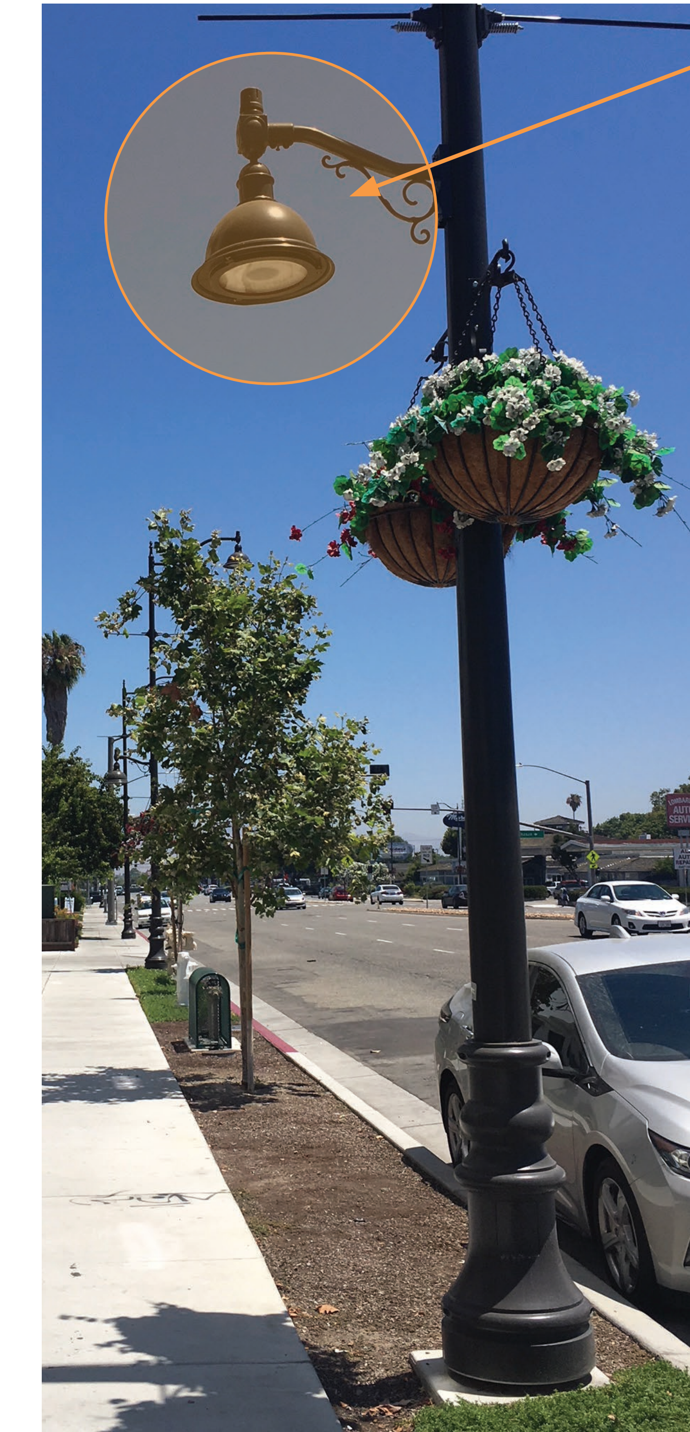
Existing ECR light pole with pedestrian light attachment

Potential to add pedestrian-oriented lamps on existing light poles, particularly at activity centers