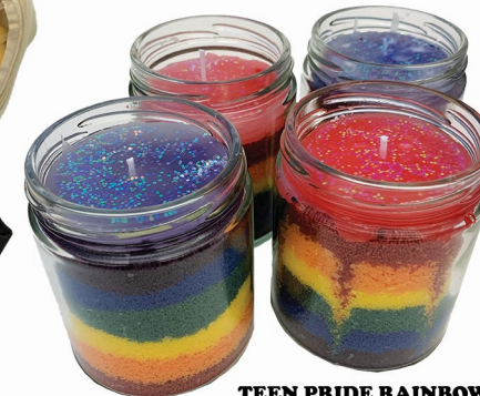
TEEN PRIDE RAINBOW CANDLE CRAFT