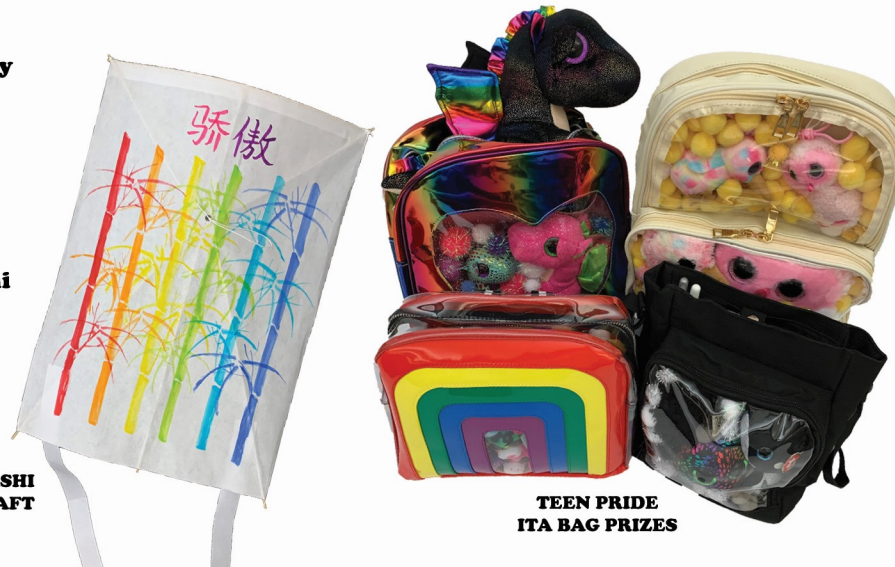
TEEN PRIDE WASHI PAPER KITE CRAFT