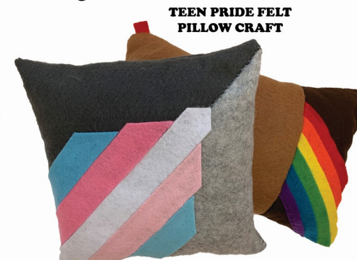
TEEN PRIDE FELT PILLOW CRAFT