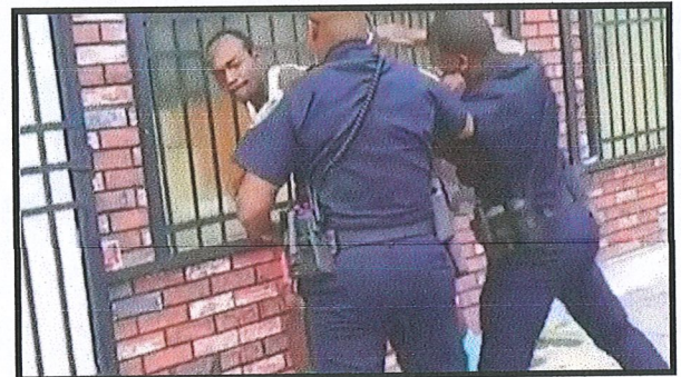
"STOP RESISTING SIR"

In today's climate, police interactions with the public have been highly publicized and critiqued. Unprofessional conduct is one of the main reasons for citizen's complaints. When police use profanity during an arrest, they are viewed by the public as unprofessional and uncontrolled. It also changes their (and prospective jurors) perception of your actions as to the level of force used. The attached article, "Police Profanity and Public Perception of Use of Force" cites a study that found perceptions of the same actions by officers changing solely on language used. Thus, an acceptable incident could be deemed "excessive" merely by using profanity.