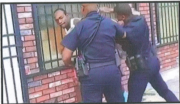
"SHOW ME YOUR FUCKING HANDS"