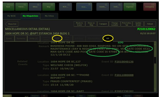
Gate Code (SCPD)