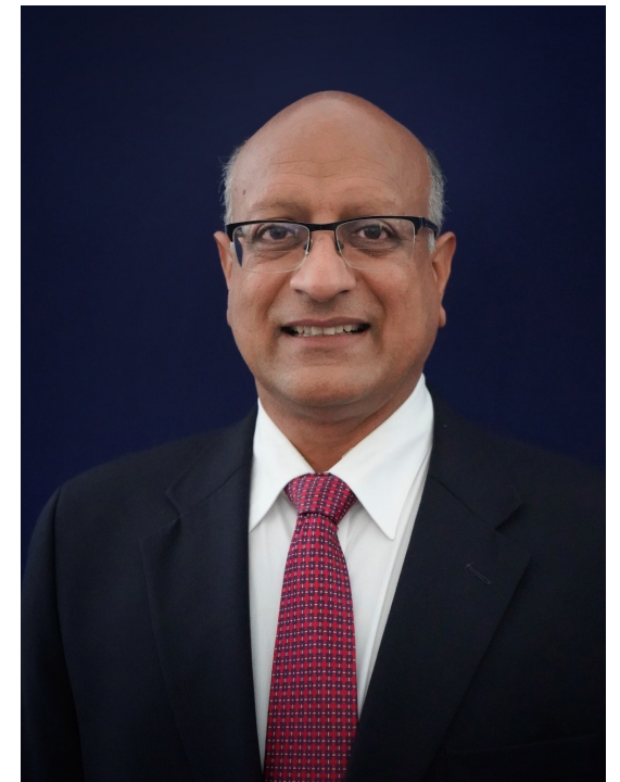
Message from Sudhanshu "Suds" Jain Vice Mayor District 5