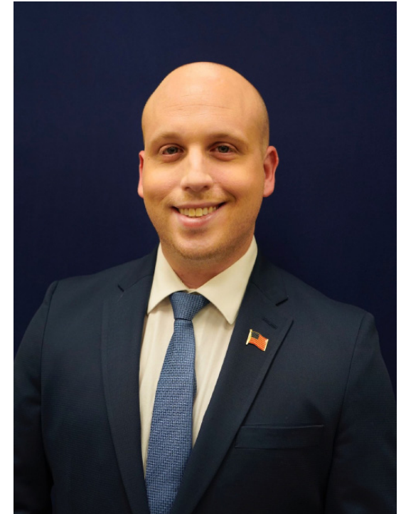
Message from Anthony Becker City Councilmember District 6

In partnership with the County of Santa Clara, the City hosts free COVID-19 testing at Central Park Library, 2635 Homestead Ave. Upcoming testing dates include: April 13, April 27, May 11, from 9:30 a.m. to 3 p.m. Typically, 3-7 days before the testing date, schedule an appointment online. Visit SCCFreeTest.org for countywide testing locations.