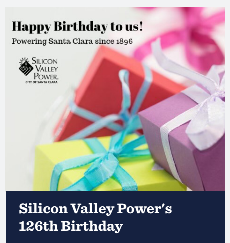
Silicon Valley Power's 126th Birthday

Happy 126th Birthday to Silicon Valley Power. Santa Clara has a rich history of quality public services. The City has owned and operated our own electric, water and sewer utilities for more than a century. This is one of the main reasons many residents and businesses have chosen to locate in the City of Santa Clara. We are very proud of the services we provide to the community and celebrate the success of our electric utility spanning the past 126 years!