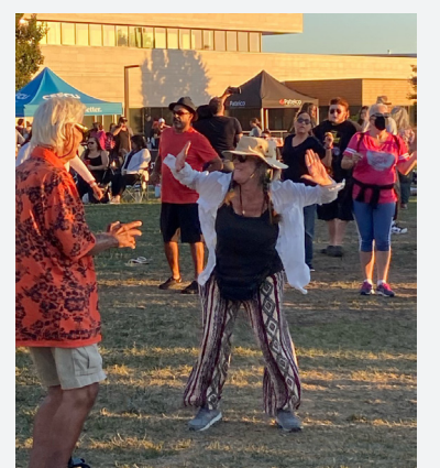
Live Oak Park Concert

Concerts in the Park return to Santa Clara. This four- part concert series kicked off in Live Oak Park with hundreds of residents happily singing and dancing to The Hitmen – a high energy band that played