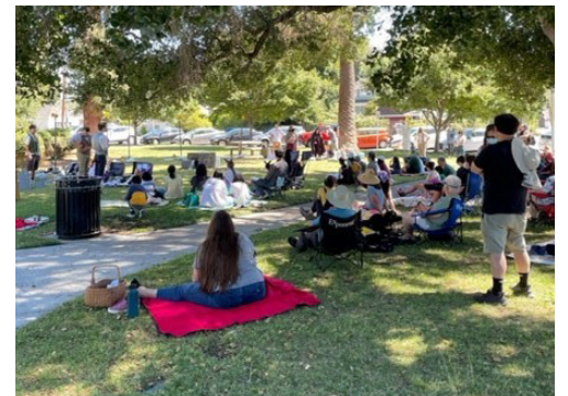
Library patrons gathered to watch the Peripatetic Players.

The Santa Clara City Library was delighted to have the Peripatetic Players back at the Mission Branch Library for their two-part production, "A Lord of a Ring in a Suitcase." Almost 100 Library patrons of all ages enjoyed this fun filled adaptation of Tolkien's trilogy. Thank you to the Santa Clara City Library Foundation and Friends for their support for this event.