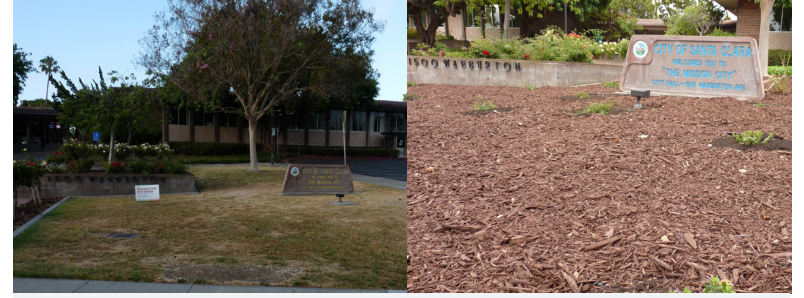
New landscape installed at City Hall. Before (left) and after (right).

The City announces its pilot City Hall Landscape Conversion Rebate project. Nearly 4,200 square feet of turf has become a drought-tolerant landscape of California native plants. Groundcover Manzanita with accents of Wild Lilac and Giant Wild Rye replace thirsty lawn, providing water-sipping greenery to showcase existing tree roses that flank the entrance walkway from Warburton Avenue. A collaboration of between the City of Santa Clara and Valley Water, this first landscape conversion at City Hall reflects necessary permanent shifts to water conservation.