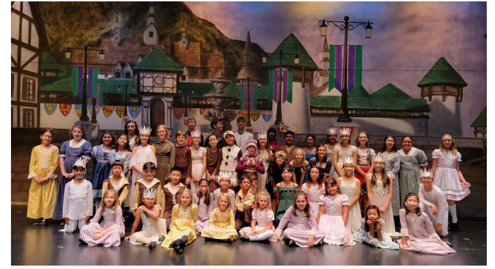
Roberta Jones Junior Theatre

RJTT finished the summer production of Disney's Frozen Jr. 52 campers spent their summer singing, dancing, and staging. The culmination of the six-week camp ended with an amazing production entertaining over 1,100 audience members in their five-performance run.