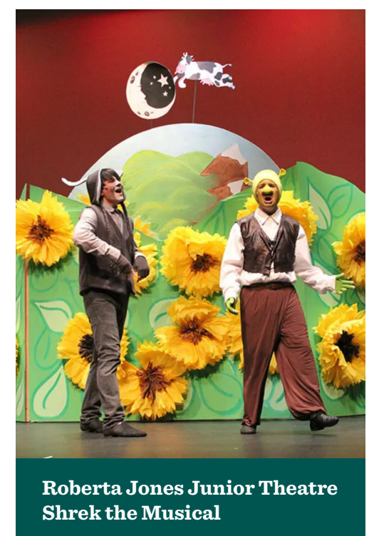
Roberta Jones Junior Theatre Shrek the Musical

Register for recreation classes for all ages and special events. Classes begin the week of Aug. 22. Visit SantaClaraCA.gov/RecClasses .