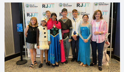
FROZEN, JR. Cast

Roberta Jones Junior Theatre has a 53-year history in Santa Clara and has provided strong performing arts opportunities for thousands of young people in our community. All children ages 4-18 are welcome to participate. The life skills learned through this program for our youth (i.e., confidence, social interaction, self-expression, personal responsibility) are invaluable, and I hope you will join me in supporting this essential youth-based program within our community. If you or your child are interested in finding out more information on how to be involved, please refer to our city's Fall Activity Guide or visit RJJT.org .