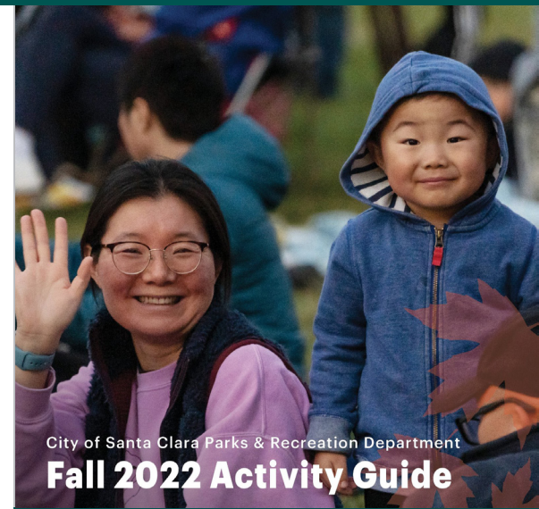
City of Santa Clara Parks & Recreation Department Fall 2022 Activity Guide

Everyone's favorite ogre is back in this hilarious stage spectacle, based on the Oscar-winning smash-hit film! Performers ages 8-18 are invited to audition for this production! Auditions will be held on Aug. 23 and 24, 4:30 - 7 p.m. Performances will be held the first two weekends in November. Visit SantaClaraCA.gov/ActiveNet to register.