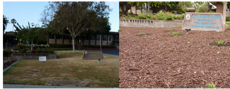
New landscape installed at City Hall. Before (left) and after (right).

The City announces its pilot City Hall Landscape Conversion Rebate project. Nearly 4,200 square feet of turf has become a drought-tolerant landscape of California native plants. Groundcover Manzanita with accents of Wild Lilac and Giant Wild Rye replace thirsty lawn, providing water-sipping greenery to showcase existing tree roses that flank the entrance walkway from Warburton Avenue. A collaboration of between the City of Santa Clara and Valley Water, this first landscape conversion at City Hall reflects necessary permanent shifts to water conservation.