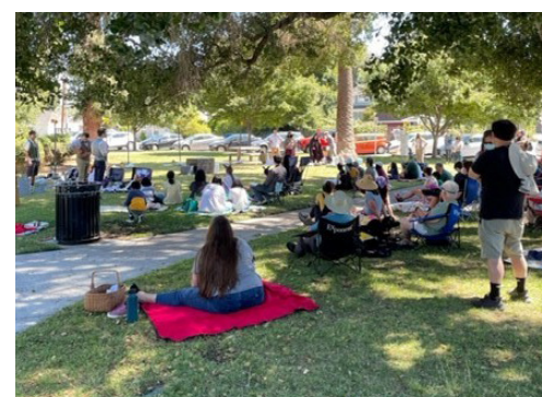
Library patrons gathered to watch the Peripatetic Players.

The Santa Clara City Library was delighted to have the Peripatetic Players back at the Mission Branch Library for their two-part production, "A Lord of a Ring in a Suitcase." Almost 100 Library patrons of all ages enjoyed this fun filled adaptation of Tolkien's trilogy. Thank you to the Santa Clara City Library Foundation and Friends for their support for this event.