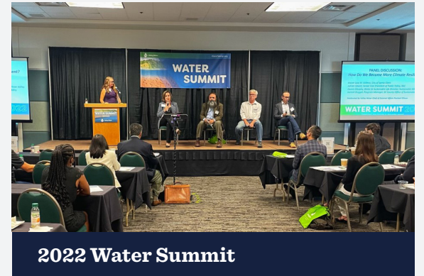
2022 Water Summit

Along with the SCVWD the City of Santa Clara is committed to increasing awareness on ways to save water, please help by doing your part. For tips on saving water, visit valleywater.org . If you have questions feel free to email our city's Water and Sewer Utilities Department at water@santaclaraca.gov . And remember: Save Water...as life can't exist without it.