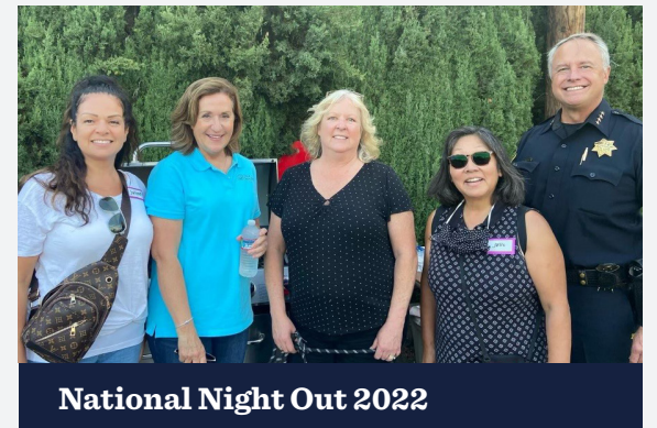
National Night Out 2022

Thank you to all who participated in National Night Out and with a special thanks to our Police and Fire Department professionals who had a welcoming presence throughout the entire event as they connected with residents and their families. That evening, I especially enjoyed observing the youngsters (with expressions of amazement on their faces) as many of them had a chance to meet police safety officers and firefighters for the very first time! If you missed this inclusive community safety event this year, please consider joining with your neighbors and participate in 2023. You'll learn tips about keeping your neighborhood safe... and you may even meet some new neighbors, and that's good too!