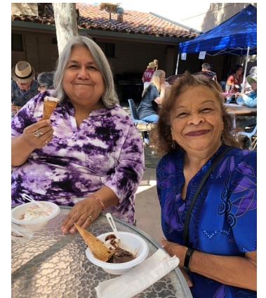
Senior Center Ice Cream Social

The Senior Center held its traditional Ice Cream Social on Wednesday, Aug. 24. Attendees enjoyed delicious ice cream and toppings on the patio with music, friends, newcomers and the opportunity to learn about programs and activities at the Senior Center .