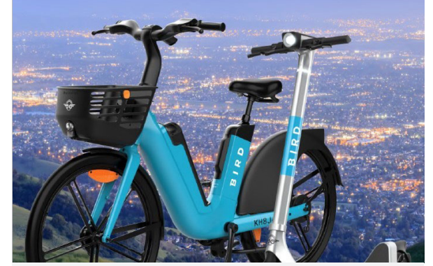
Bicycle and scooter share