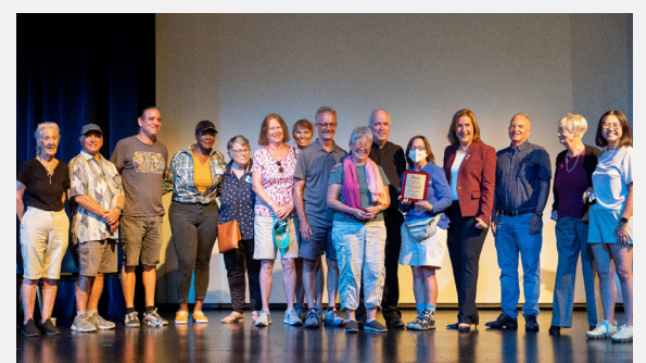
St. Justin’s Community Ministry