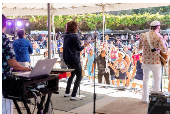
Santa Clara Art & Wine Festival

The Art & Wine Festival held on Sept. 17-18 was a huge success to celebrate 40 years. An estimated 30,000 festival goers enjoyed the delicious food, fine wine, craft beer, arts and crafts booths, Kids Kingdom activities and much more. Eight bands performed on the SVP Pavilion Stage with nearly 20 groups entertaining the crowd at the Community Stage in Kids Kingdom. A special thanks to all our sponsors, artists, community groups, volunteers, City staff, and festival goers! Despite the rainy weather on Sunday, it was a wonderful weekend benefiting local charities. Mark your calendars for the 2023 Art & Wine Festival on Sept. 16-17.