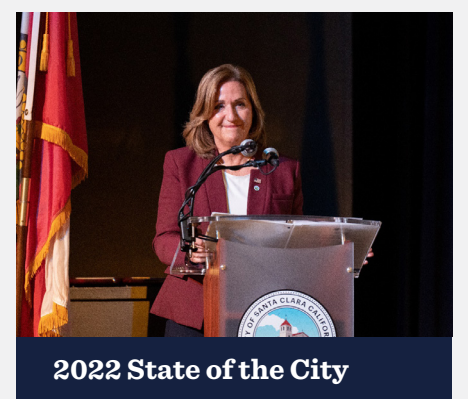
2022 State of the City