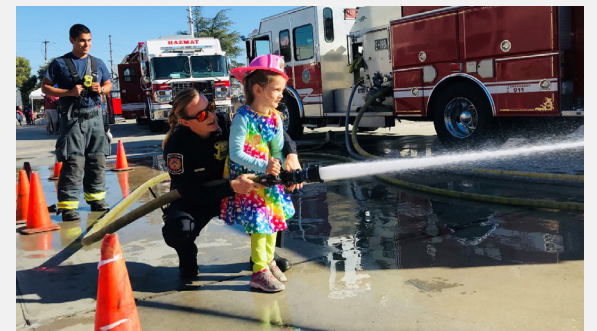
Firehouse Family Fair and Open House

There will be firefighter demonstrations such as auto extrication, rappelling, fire extinguisher demonstrations, kids agility courses, and many other fun activities. Learn hands-only CPR and how to safely exit a building during a fire. Our dedicated Santa Clara Fire Dept. Staff will be available to answer any questions you may have about keeping your home and family safe. And as an added bonus, Kona Ice will be there to provide refreshing treats as well.