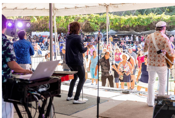
Santa Clara Art & Wine Festival

The Art & Wine Festival held on Sept. 17-18 was a huge success to celebrate 40 years. An estimated 30,000 festival goers enjoyed the delicious food, fine wine, craft beer, arts and crafts booths, Kids Kingdom activities and much more. Eight bands performed on the SVP Pavilion Stage with nearly 20 groups entertaining the crowd at the Community Stage in Kids Kingdom. A special thanks to all our sponsors, artists, community groups, volunteers, City staff, and festival goers! Despite the rainy weather on Sunday, it was a wonderful weekend benefiting local charities. Mark your calendars for the 2023 Art & Wine Festival on Sept. 16-17.