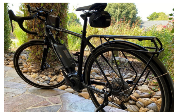
Electric bicycle rebates

If you're thinking of upgrading to an electric bicycle (e-bike), Silicon Valley Power is offering a rebate of 10% of the purchase price, up to $300. Income-qualified customers can receive an additional rebate up to $200. Funds are limited and rebates will be processed in the order in which they are received. Rebate applications must be submitted within 60 days of the date of purchase. For details, visit SiliconValleyPower.com/Rebates .