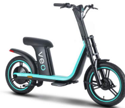
Bicycle and Scooter Share

On Dec. 7, 2021, the City Council approved the Shared Mobility Program (Program), which allows private operators to deploy shared mobility devices (bicycles and scooters) in Santa Clara. The City selected two operators, Bird and Veo, to begin operation in Santa Clara. The operators plan to provide up to 1,300 devices total with a mix of both bicycles and scooters. On Aug. 8, 2022, Bird received their operating permit and officially launched and deployed 800 e-scooters and 200 e-bikes throughout the City. On Oct. 27, 2022, Veo received their operating permit and officially launched and will be deploying 300 e-scooters throughout the City in the next few weeks. Devices are to be parked on sidewalks and should provide adequate clearances to not obstruct use of the sidewalk. To submit inquiries about bicycle and scooter share issues, use the MySantaClara App. For more information about the Program, please visit: santaclaraca.gov/sharedmobilityprogram or contact Ralph Garcia at Rgarcia1@SantaClaraCA.gov or at 408-615-3026.