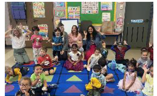
Adventures in Learning