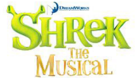
Shrek the Musical