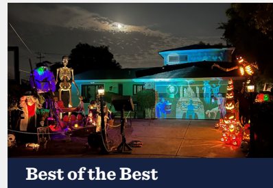
Best of the Best

Note: No submissions were received this year for District 5.