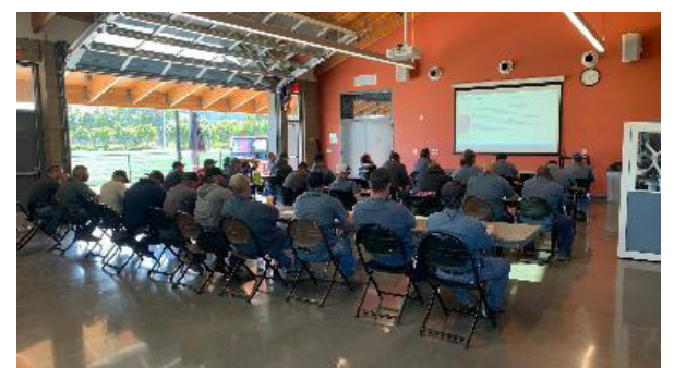
Parks Division Training

Dust off the inflatables, lights, and holly! The Cultural Commission invites the community to participate in this year's Holiday Home Decorating Contest starting Dec. 1. A map of decorated home will be available so you can show off your festive décor! Visit SantaClaraCA.gov/Contest for additional information.