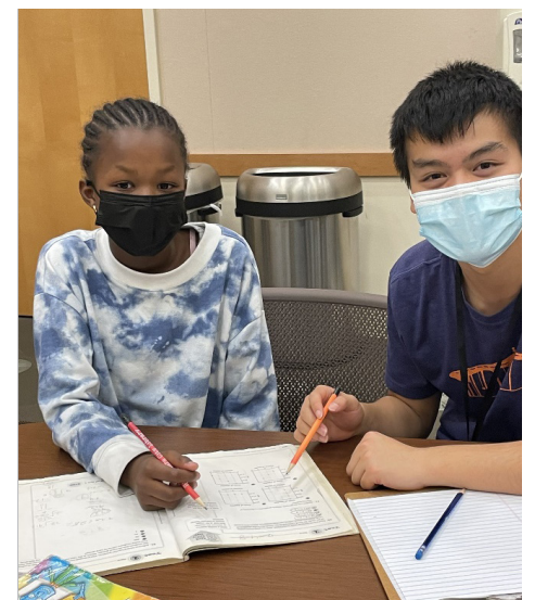
Homework Help Center

The Santa Clara City Library and Santa Clara City Library Foundation & Friends received a California State Library grant to offer opportunities for teens to gain job experience by participating in a Teen Library Internship at Central Park Library. During the internship, the teens participated in enrichment opportunities including resume building, interview practice, financial planning and teamwork bonding. In November, the Library started a small Homework Help Center where the teen interns assist struggling students within the Santa Clara Unified School District with their weekly assignments and reading practice. The Teen Interns are working one-on-one with 10 students on a weekly basis, with plans to expand help to more students in 2023.