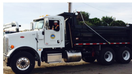
Recycle Your Holiday Tree