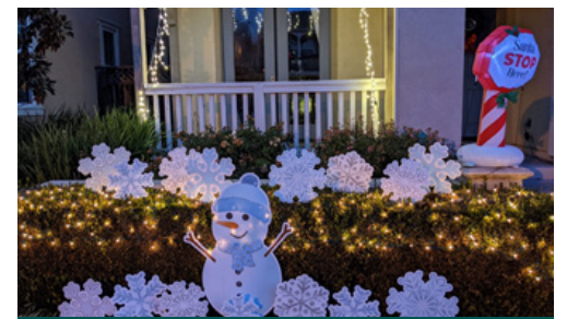
Home Decorating Contest

Beginning the week of Oct. 31 through Dec.16 , Santa Clara residents age 50+ will have access to the Senior Center Natatorium Monday through Thursday. Register and take an aquatic fitness class on Mondays and/or Wednesday mornings, and/or attend the drop-in swim hours on Tuesday and Thursdays from 9 a.m. to 12 p.m. The Natatorium is staffed by certified lifeguards and classes are taught by aquatic instructors with three indoor pools that provide opportunities for aquatic exercise, stretching, and low impact/slow muscle movement. Drop-in swim hours require a Premium Senior Center Membership Card, or a current Senior Center Card. If you would like to upgrade your membership to include pool access, visit the Senior Center front desk. Visit the Fitness Center & Natatorium Use Guidelines for more information.