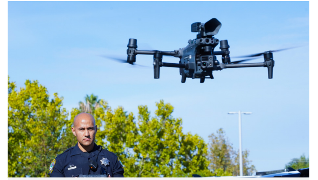
SCPD Unmanned Aircraft Systems

In the coming months, SCPD will be blending the use of UAS with its existing operations and technology. Meanwhile, historical information about the development of program is available online on SCPD's webpage .