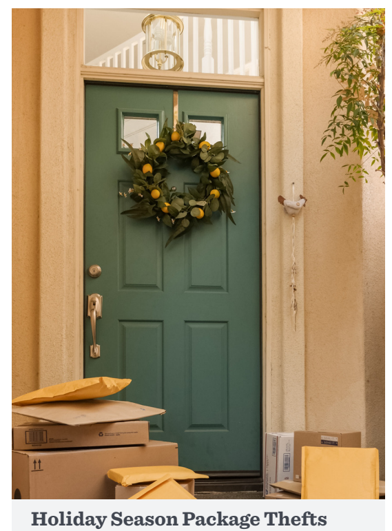
Holiday Season Package Thefts

Report suspicious activity to the Police Department by calling the non-emergency phone line at (408) 615-5580. Public Safety Dispatchers will want to know details of the suspicious activity, suspect(s) description, vehicle details and direction of travel. Should you happen to witness a crime, do not approach the suspect. Instead, be a good witness and dial 9-1-1 immediately.