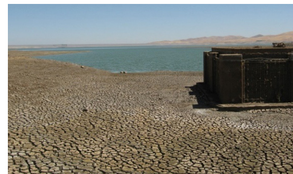
Save Our Water During Droughts

Residential holiday trees will be collected curbside on regular garbage collection days during the week of Jan. 9 - Jan. 13. Remove all ornaments, tinsel, nails, and the stand. After Jan. 13, cut up your tree and place the pieces in your green yard trimmings cart. Flocked trees are not compostable and should be cut up and placed in your garbage cart. For more information on holiday tree recycling and set-out instructions, visit SantaClaraCA.gov/CleanSC or call the Department of Public Works at 408-615-3080.