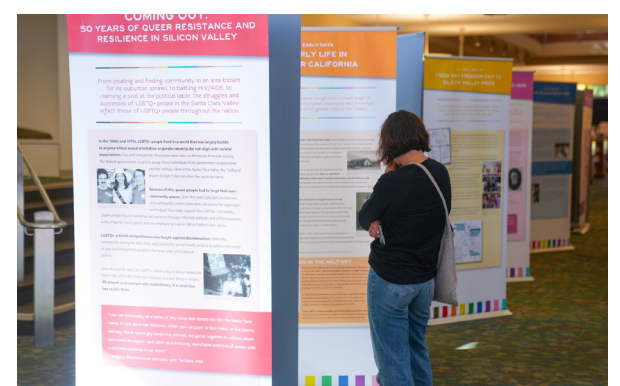
Queer Silicon Valley Exhibit

The Queer Silicon Valley traveling exhibit is now on display at Central Park Library, 2635 Homestead Ave., in Santa Clara! This showcase of LGBTQ+ history provides an education on the struggles and achievements of the LGBTQ+ community and 50 years of Queer resistance and resilience in Silicon Valley. Visit SCLibrary.org for library hours. For more information about the exhibit, visit QueerSiliconValley.org .