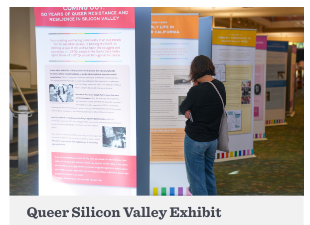
Queer Silicon Valley Exhibit

The Queer Silicon Valley traveling exhibit is now on display at Central Park Library, 2635 Homestead Ave., in Santa Clara! This showcase of LGBTQ+ history provides an education on the struggles and achievements of the LGBTQ+ community and 50 years of Queer resistance and resilience in Silicon Valley. Visit SCLibrary.org for library hours. For more information about the exhibit, visit QueerSiliconValley.org .