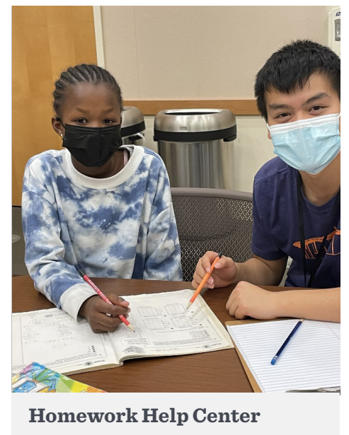
Homework Help Center

The Santa Clara City Library and Santa Clara City Library Foundation & Friends received a California State Library grant to offer opportunities for teens to gain job experience by participating in a Teen Library Internship at Central Park Library. During the internship, the teens participated in enrichment opportunities including resume building, interview practice, financial planning and teamwork bonding. In November, the Library started a small Homework Help Center where the teen interns assist struggling students within the Santa Clara Unified School District with their weekly assignments and reading practice. The Teen Interns are working one-on-one with 10 students on a weekly basis, with plans to expand help to more students in 2023.