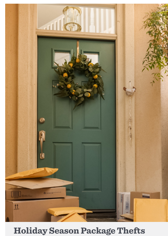
Holiday Season Package Thefts

Report suspicious activity to the Police Department by calling the non-emergency phone line at (408) 615-5580. Public Safety Dispatchers will want to know details of the suspicious activity, suspect(s) description, vehicle details and direction of travel. Should you happen to witness a crime, do not approach the suspect. Instead, be a good witness and dial 9-1-1 immediately.