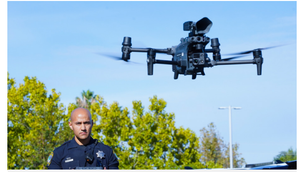
SCPD Unmanned Aircraft Systems

In the coming months, SCPD will be blending the use of UAS with its existing operations and technology. Meanwhile, historical information about the development of program is available online on SCPD's webpage .