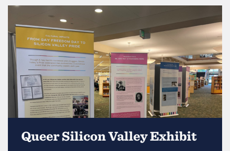
Queer Silicon Valley Exhibit