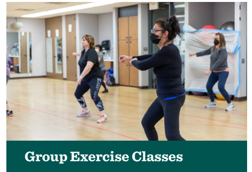
Group Exercise Classes

The Parks & Recreation Department has your recreation needs covered with many classes and camps starting in February. From gymnastics, drawing and ceramics to soccer and martial arts, we have your interests covered. For adults 50+, there is a variety of fitness or aquatics classes to choose from. Spaces are limited. Visit SantaClaraCA.gov/RecClasses for more information and to register.