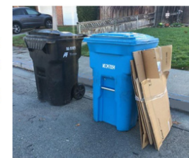
Fold Your Cardboard Boxes