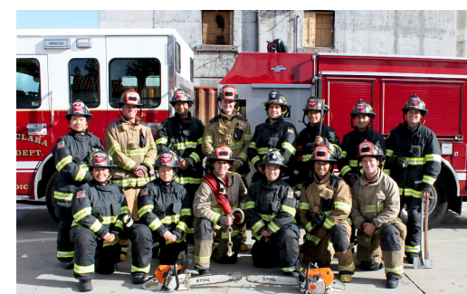
SCFD Academy Graduates

Seven new Santa Clara Fire Department (SCFD) firefighter recruits have graduated the fire academy and are beginning their professional firefighting careers with the City of Santa Clara! The 19 week-long Santa Clara Joint Fire Academy was hosted by SCFD and was comprised of 14 recruits from 3 different fire agencies from the cities of Santa Clara, Palo Alto, and Santa Clara County. Families and friends attended graduation at the Mission City Center for Performing Arts at Wilcox High School on Jan 13. Please welcome our newest members to the SCFD and wish them the best in their 2-year probation period and in their professional careers!