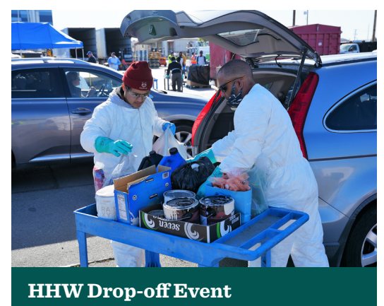
HHW Drop-off Event

Santa Clara residents can safely dispose of Household Hazardous Waste (HHW) at the free HHW drop-off event that will take place on Saturday, April 29 . Hazardous items that can be disposed of include fluorescent light tubes, compact fluorescent lightbulbs, paint, automotive fluids, cleaners, solvents, batteries, propane and helium tanks, fertilizers, pesticides, wood preservatives, sharps containers, prescription medications, electronic waste (e-waste), and other types of household hazardous wastes. Items NOT accepted include large household appliances, ammunition, explosives, or containers larger than five gallons. Please contact the Police Department at 408-615-4700 regarding the disposal of ammunition or explosives. Residents must register to attend this event by calling the County Household Hazardous Waste Program at 408-299-7300 or by visiting hww.sccgov.org .