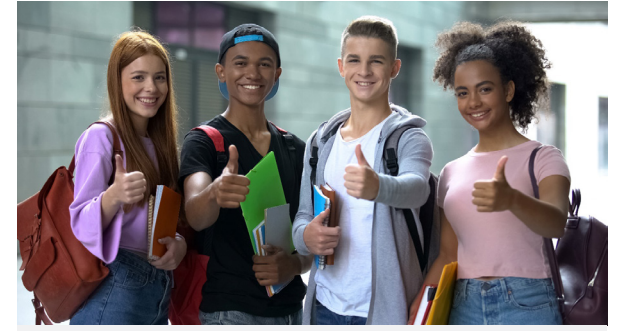
High School Grants Available

Silicon Valley Power is offering grants up to $5,000 for high school students to create projects or awareness campaigns that will educate the Santa Clara community about energy efficiency and/or renewable energy. The program is open to high school students who live in the City of Santa Clara or attend school at a site located within Santa Clara city limits. Grant awards will be made twice per year with deadlines on June 30 and December 31. For complete eligibility requirements and program details, visit SiliconValleyPower.com/Grants .