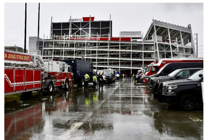
Civil Support Team Bay EX Drill