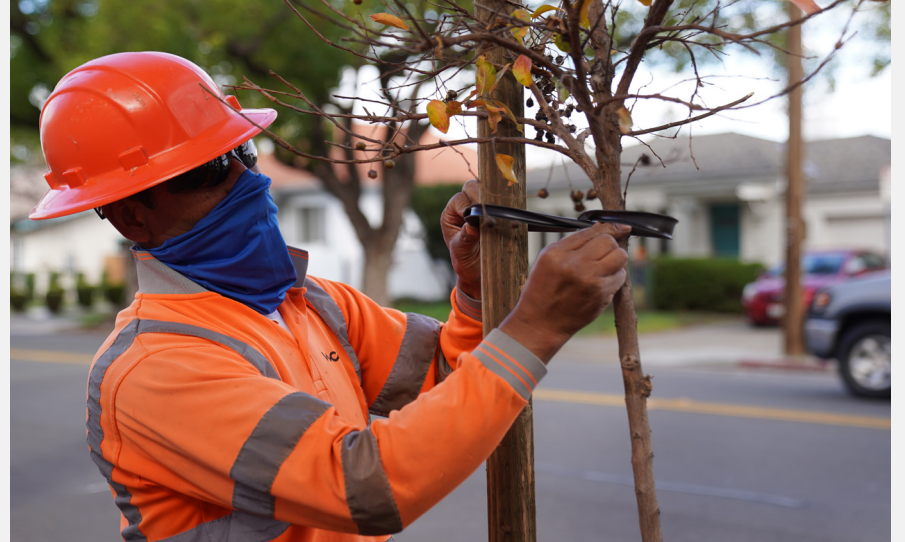
Street Tree Planting Program