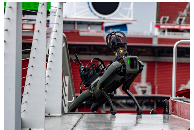
Civil Support Team Bay EX Drill

In May, Silicon Valley Power (SVP) will be proposing a mid-year rate increase of 5% to the Santa Clara City Council. If approved, the rate increase will take effect July 1, 2023. High natural gas prices have had a significant impact on electric and gas utilities throughout California, increasing by 500%, which has caused power prices to rise 150% higher than usual. In response, SVP has tightened the budget, pared down spending and is using appropriate reserves. However, a mid-year rate adjustment will be necessary. For residential customers, SVP will be proposing a one-time climate credit that is intended to help cover the increased costs. SVP offers resources on its website for customers who are looking to find ways to reduce energy usage and lower their electric bills. In addition to appliance rebates, you can find energy saving tips and a tool lending library to measure the use of plug loads such as televisions, video game consoles, computers, etc. Visit SiliconValleyPower.com/Residents for more information. Income-qualified customers may be eligible for a rate discount of up to 40%. For more information and income eligibility requirements, please visit SiliconValleyPower.com/Assist .