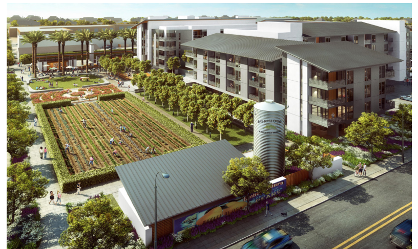
Affordable Housing Opportunity

Agrihood is a new senior community serving qualified households 55 or older. Veterans and seniors living and/or working in Santa Clara preferred. Maximum income ranges from $47,200 - $109,200 and rents are restricted based on the apartment type and household size. The initial lottery period has closed, but applications are still being accepted for the waitlist. Apply online today!