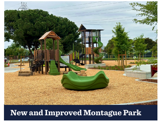
New and Improved Montague Park

Check out the new playground, basketball court, picnic area, and adult fitness equipment at Montague Park! This updated park located at 3595 MacGregor Ln., has something for all ages and abilities. Please pardon our dust as we finish the building upgrades and rehabilitation. Visit SantaClaraCA.gov/ParkProjects for more information.