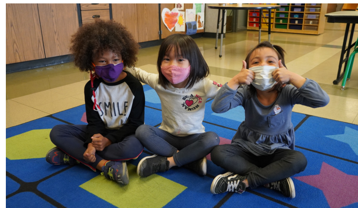
Spend Your Summer in Santa Clara

Calling all actors, 13 to 19! Get ready to rock 'n' roll with Roberta Jones Junior Theatre's production of Grease! Join us for a night of music, dancing, and high school shenanigans in the 1950's. Auditions will take place on Tuesday, June 13 and callbacks will be held Wednesday, June 14 and Thursday, June 15. Bring an audition song and be prepared to dance. All teens that audition will be cast in the production. Sign up today at SantaClaraCA.gov/ActiveNet or call the Community Recreation Center at 408-615-3140.