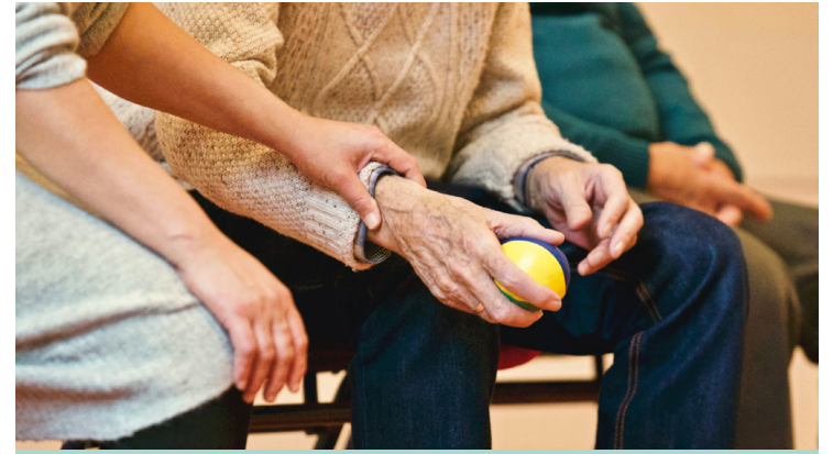
Caregiver Support Group

If you are grieving the loss of a loved one, join us for a free, peer-to-peer grief support group. This will be a safe, confidential space that will give you an opportunity to meet others who are grieving, share experiences, and support each other in coping. This group will meet starting June 15, every other Thursday, 12:30 – 1:45 p.m., over the course of 20 weeks, for a total of 10 sessions. Registration is required and this will be a closed group. New members can join until June 29. See Activity #27392 or contact the Senior Center Front Desk for assistance at 408-615-3170.