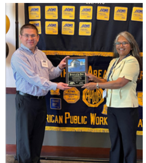
Department of Public Works

In May, the local chapter of the American Public Works Association (APWA) awarded the Department of Public Works (DPW) with Project of the Year awards for two projects: the Laurelwood Stormwater Pump Station Rehabilitation Project and the Harris-Lass Museum Tank House Restoration & Porch Repair Project. The Harris Lass Project won the under the historical restoration and preservation category while the Laurelwood Stormwater Pump Station Project won under the structures between $2 mil – $5 mil category. For more, visit the City's webpage .