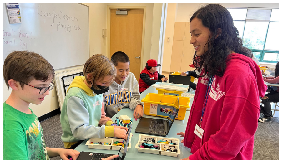
LEGO Robotics Workshops