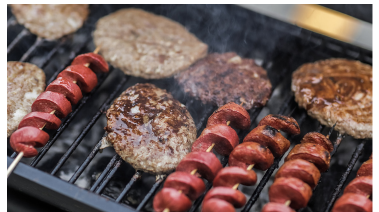
Senior Center BBQ Season