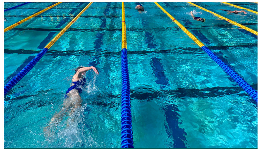
3-in-1 Activity Pass

A Resident Youth Card Membership is required to participate in the Youth & Teen Center after school program, skate park, summer open gym, and summer recreation swim program. The annual Resident Youth Card Membership renewal is $30.00 and can be purchased online at SantaClaraCA.gov/ActiveNet or at the Youth & Teen Center at 2446 Cabrillo Avenue.