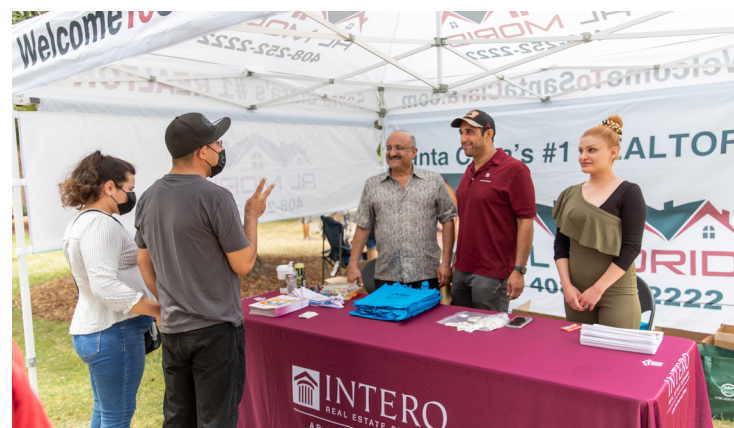
Special Event Sponsors