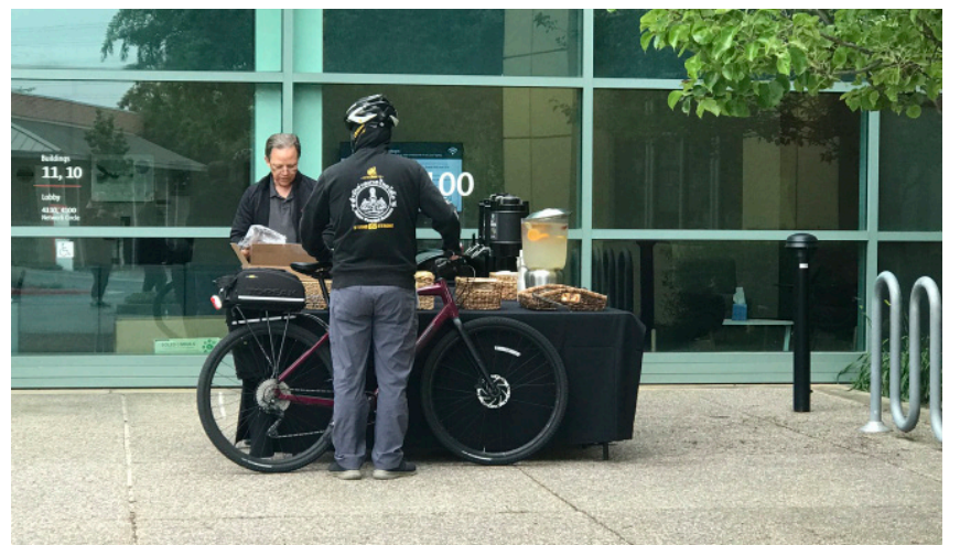
Bike to Wherever Days 2023

Thank you to all who participated in the Bike to Wherever Days during the month of May or participated in Bike To Work Day on May 18. Cities in the Bay Area continue to provide bicycle friendly streets and safer routes including Santa Clara. If you would like to get involved and be a part of the solution, the City of Santa Clara's Bike Pedestrian Advisory Committee meets on the fourth Monday of the month - five times a year (January, March, June, August and October). For more information, you can go to: Bicycle and Pedestrian Advisory Committee | City of Santa Clara (santaclaraca.gov) .