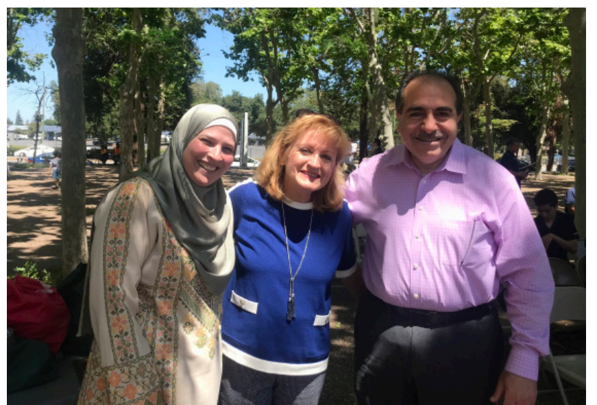
County of Santa Clara Palestinian Cultural Day

Councilmember, District 1 City of Santa Clara