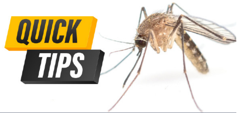
Mosquito Season Resources

The County of Santa Clara is letting Bay Area residents know that warmer weather is coming and that means mosquitoes are too. With all the rain we received this year, we are anticipating more mosquito activity. Follow the County of Santa Clara on Twitter, Facebook, and Instagram to receive reminders and tips on vector prevention and protection. You can subscribe for mosquito treatment notifications to know when West Nile virus treatments are taking place. Subscribe to the County's monthly newsletter to receive additional resources. Visit linktr.ee/SCCVCD to follow the County on social media or to subscribe to their notifications and newsletter.