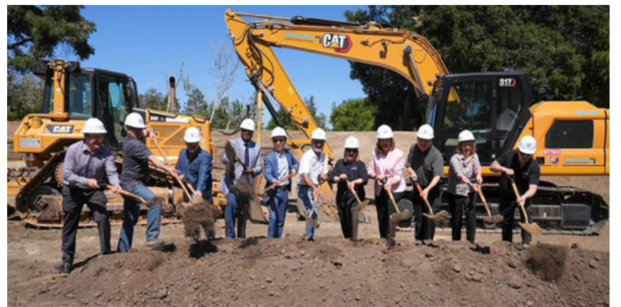
Magical Bridge Playground Groundbreaking