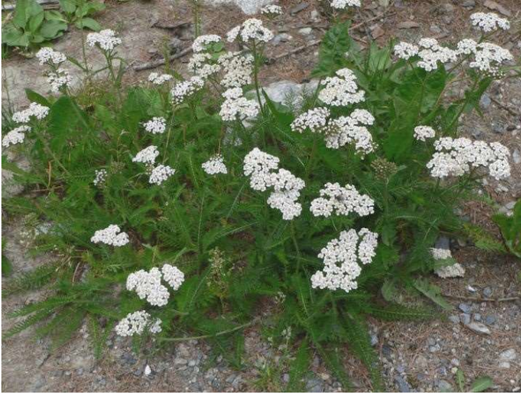
Achillea millefolium & hybrids Common Yarrow 4