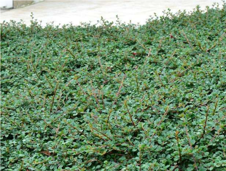
Cotoneaster 'Streibs Findling' Streibs Findling Cotoneaster 50