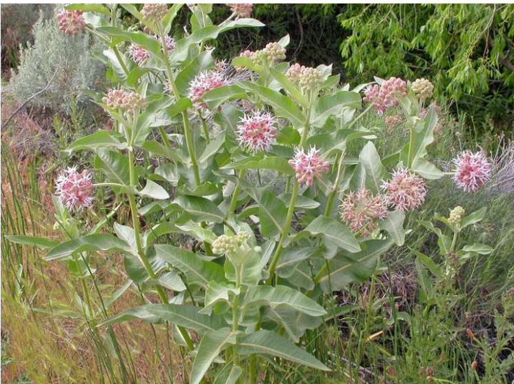
Asclepias (wild species; some native) Milk Weed 2