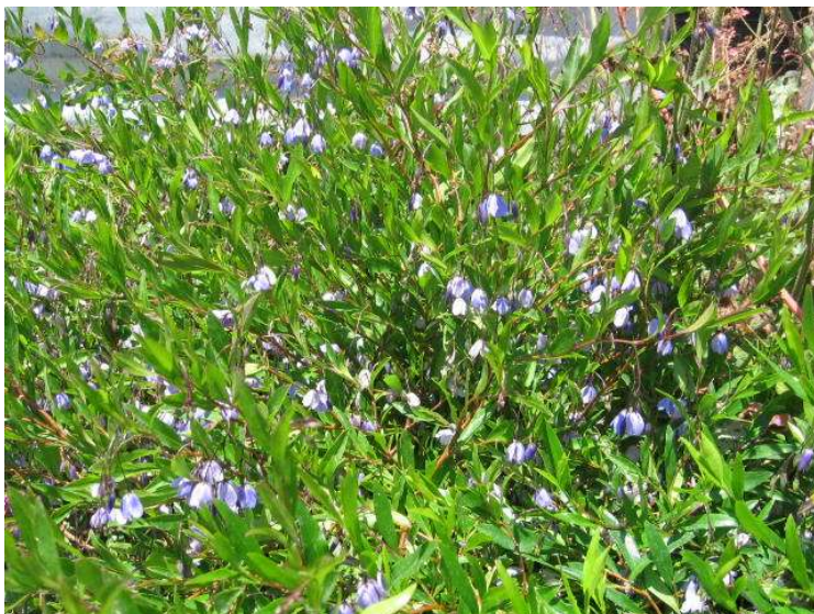
Sollya heterophylla Australian Bluebell Creeper 16