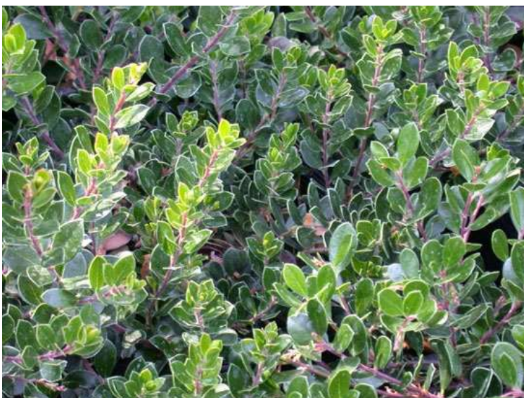
Arctostaphylos 'Emerald Carpet' Manzanita 28