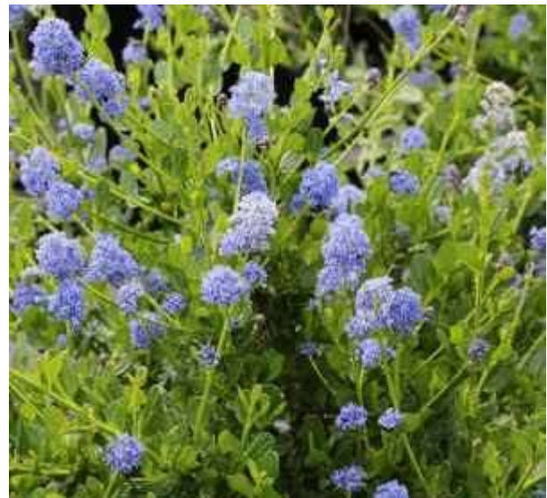
Ceanothus 'Victoria' Victoria California Lilac 95