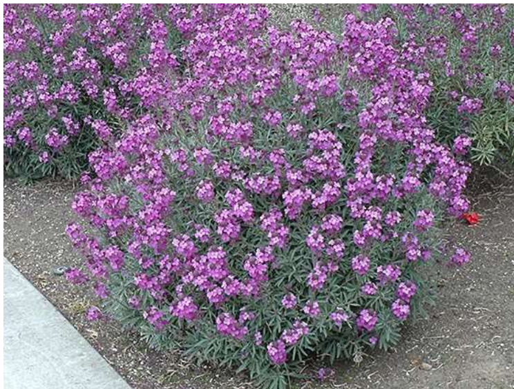
Erysimum 'Bowles Mauve' Wallflower 20