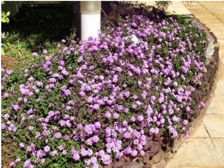
Lantana montevidensis Trailing Lantana 20