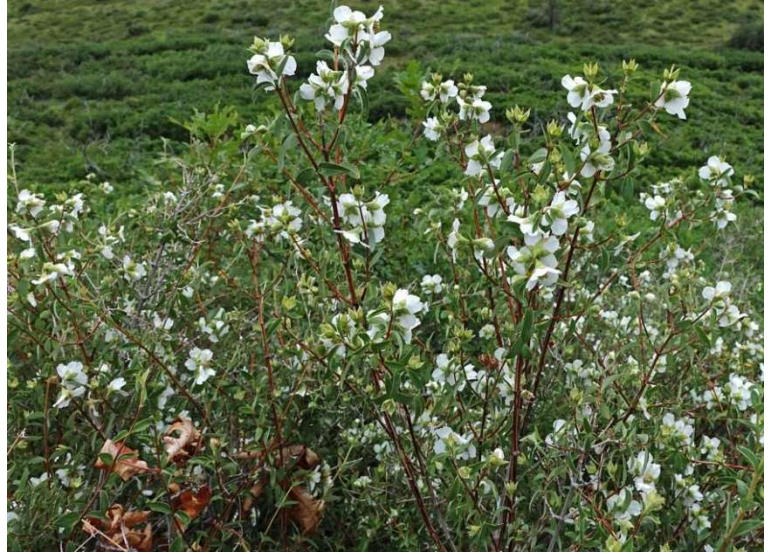
Philadelphus microphyllus Littleleaf Mock Orange 28