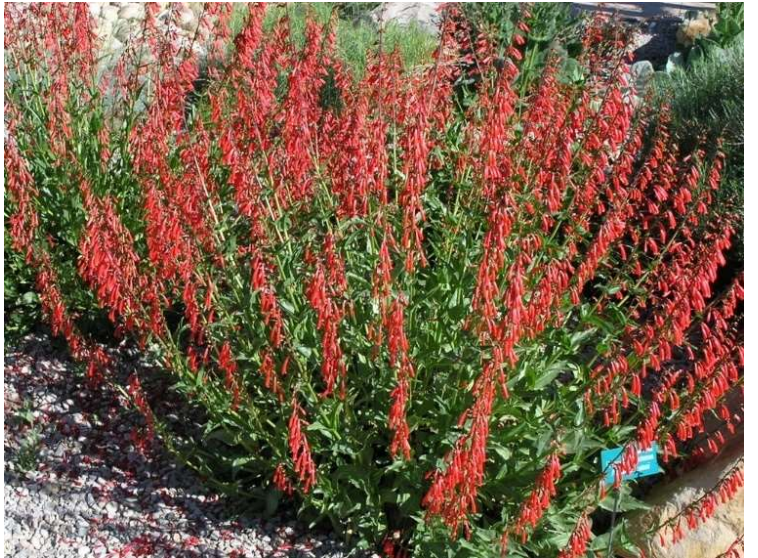
Penstemon eatonii Firecracker Beardtongue 3