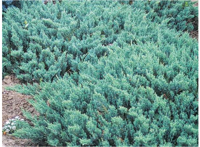
Juniperus 'Blue Chip' Blue Chip Juniper 38