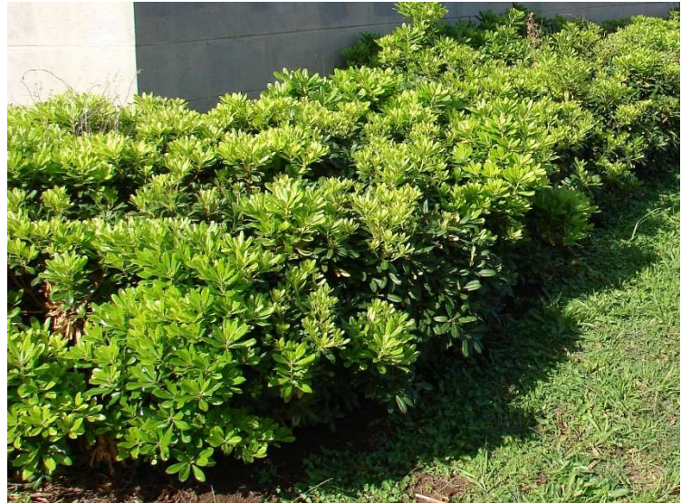
Pittosporum tobira Mock Orange 87