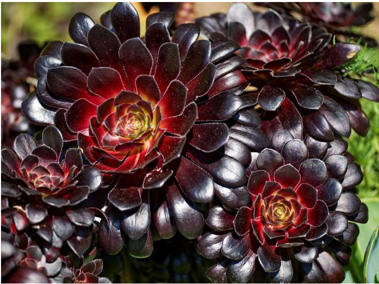
Aeonium 'Zwartkop' Black Rose Aeonium 2