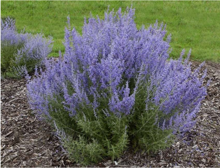
Perovskia atriplicifolia Russian Sage 5