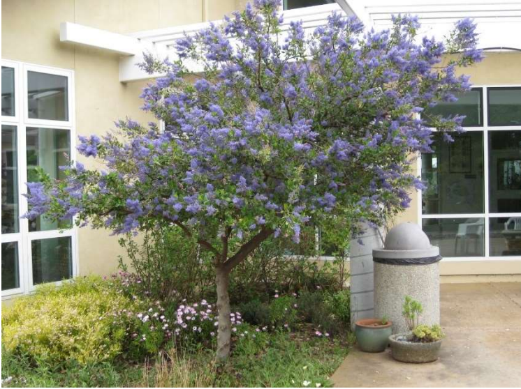
Ceanothus 'Ray Hartman' Wild Lilac 177