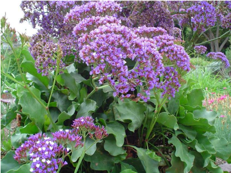
Limonium perezii Statice/Sea Lavender 3