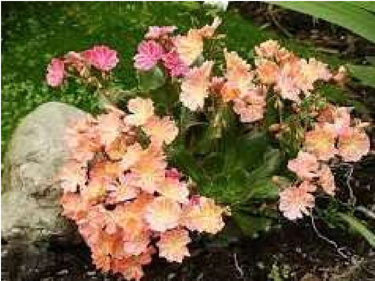
Lewisia spp. Lewisia 1