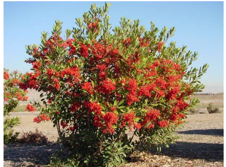
Heteromeles arbutifolia Toyon 79