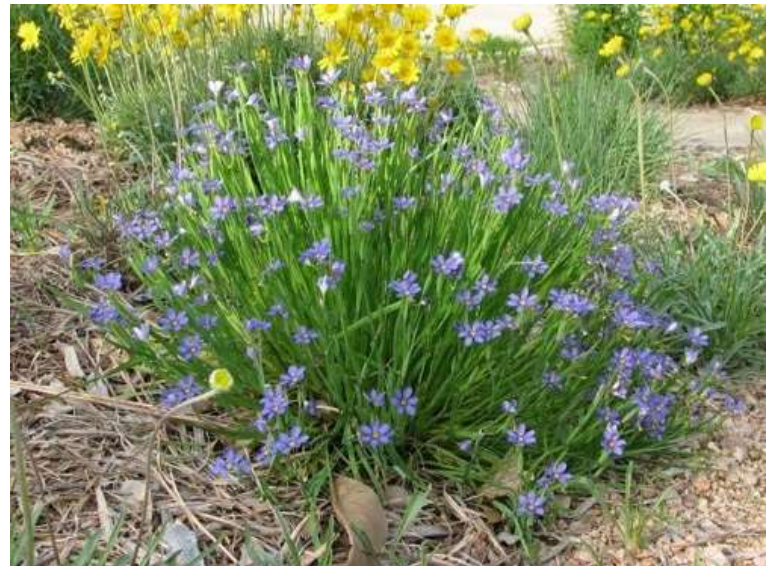
Sisyrinchium bellum Blue-Eyed Grass 2