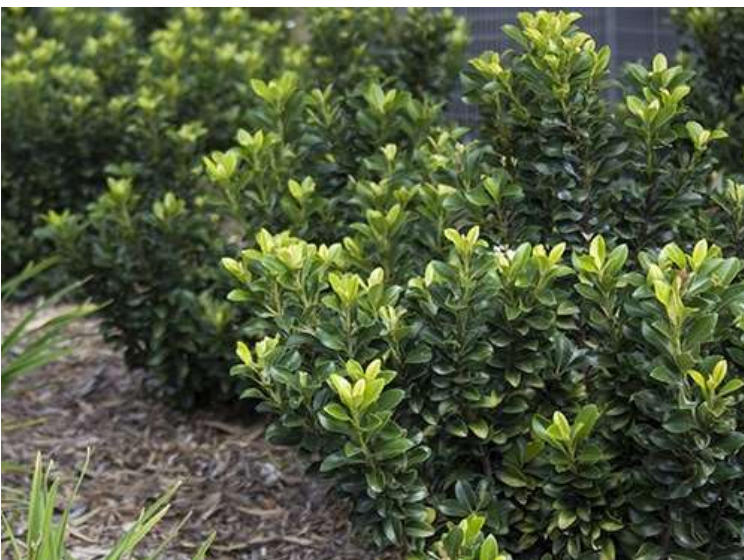
Raphiolepis umbellata Indian Hawthorne 20