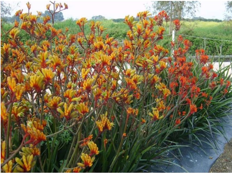
Anigozanthos flavidus Kangaroo Paw 5