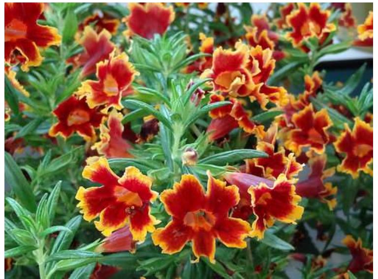
Mimulus 'Jellybeans' Monkey Flower 2