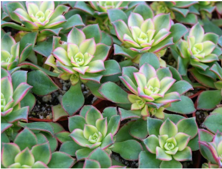
Aeonium 'Kiwi' Kiwi Aeonium 5