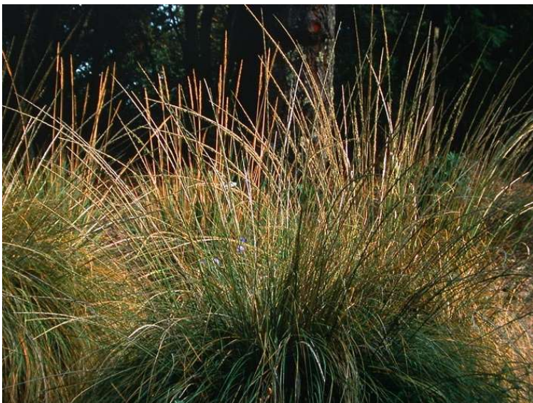
Muhlenbergia rigens Deer Grass 13