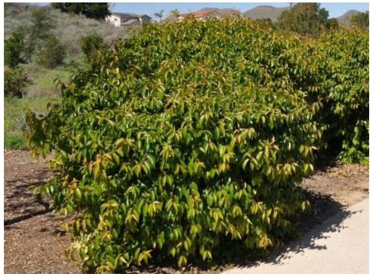
Xylosma congestum Shiny Xylosma 64