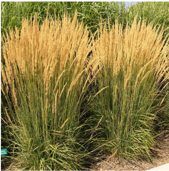
Calamagrostis spp. Feather Reed varies