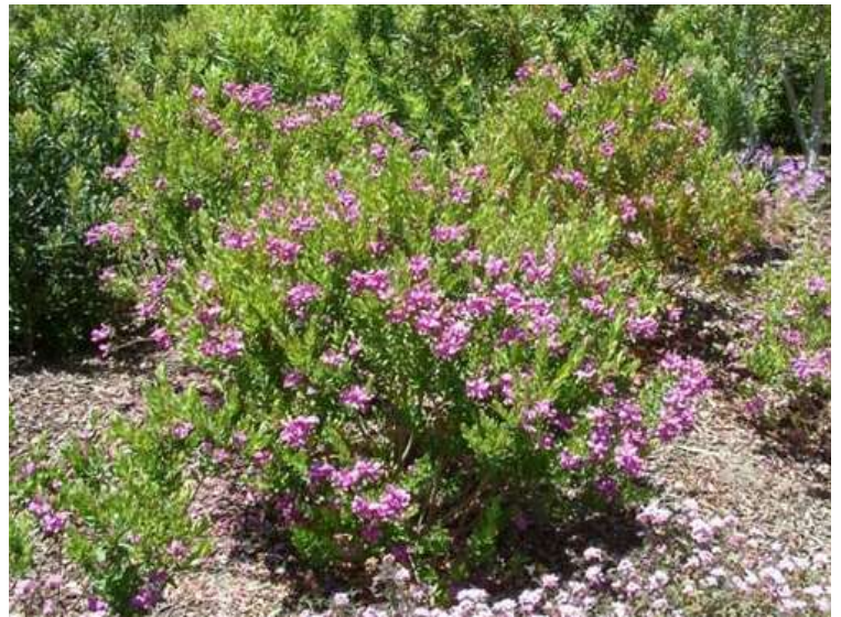
Polygala x dalmasiana Sweet Pea Shrub 13