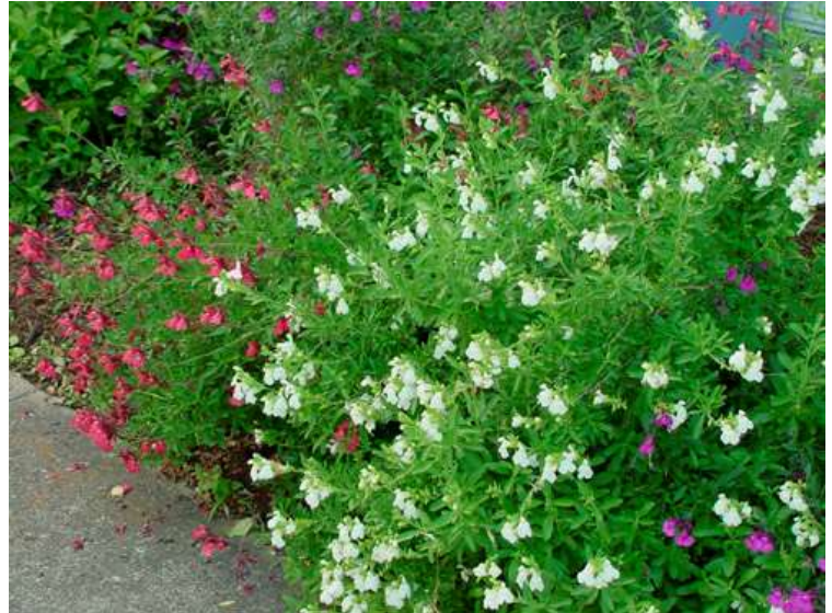
Salvia greggii & hybrids Autumn Sage 5