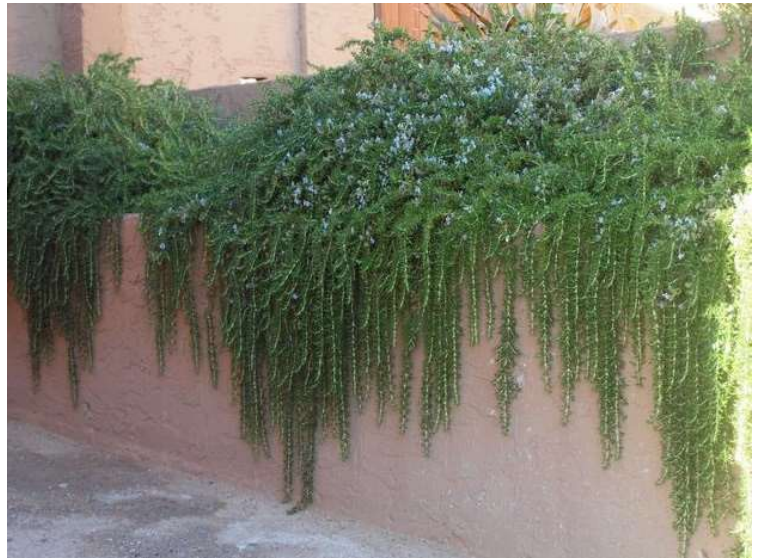
Rosmarinus o. prostratus Creeping Rosemary 50