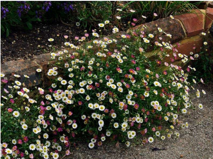
Erigeron karvinskianus Fleabane 7