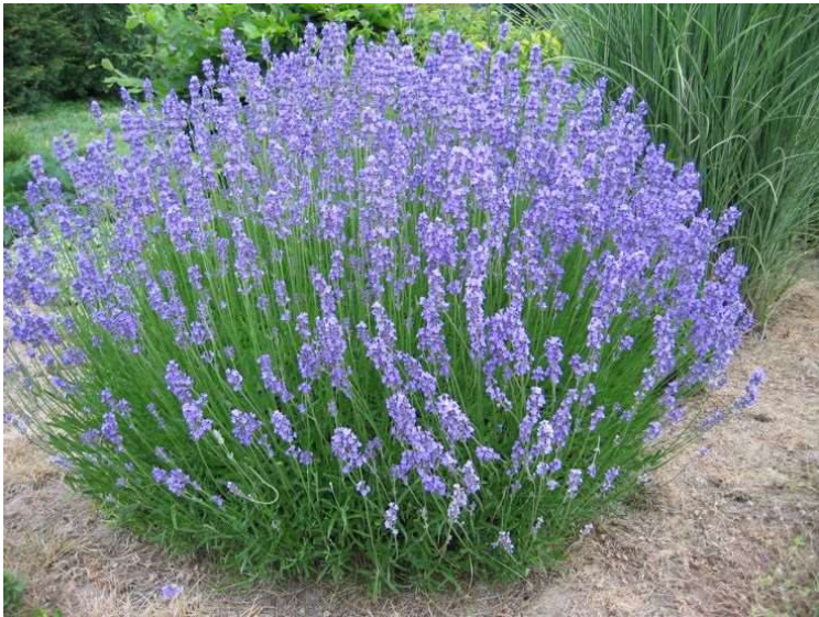
Lavandula spp. Lavender 7