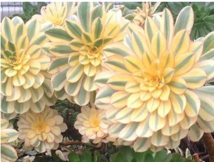
Aeonium 'Sunburst' Copper Pinwheel 2