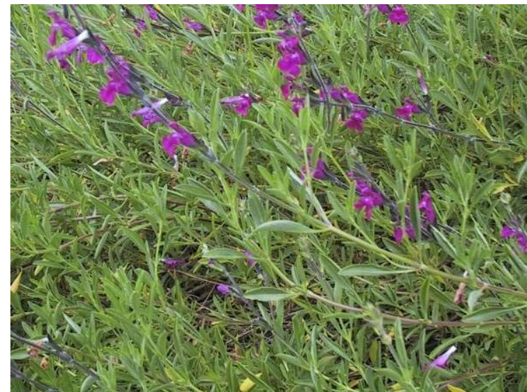
Salvia muelleri Royal Purple Autumn Sage 20