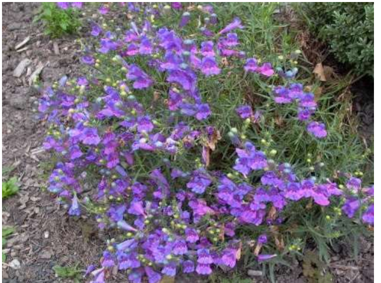
Penstemon 'Margarita BOP' Beardtongue 7