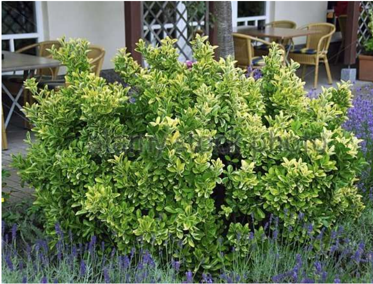
Euonymus japonicus Evergreen Euonymus 28