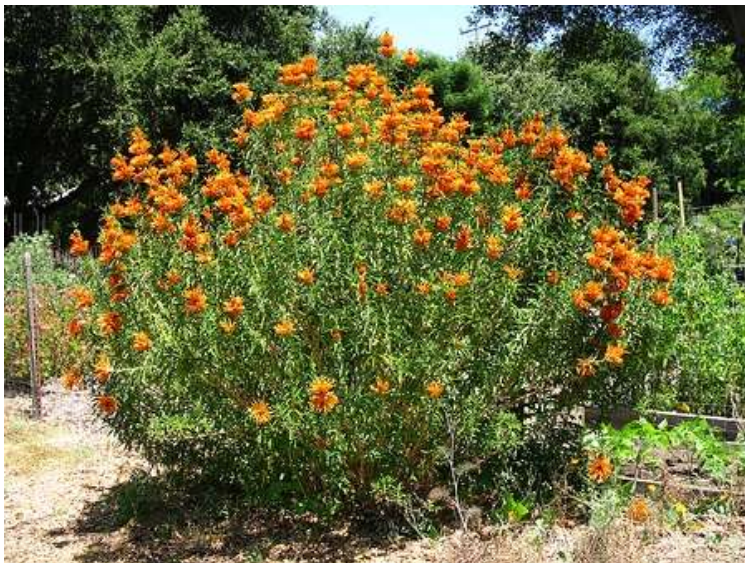
Leonotis leonurus Lion's Tail 20