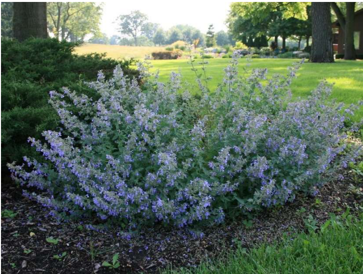
Nepeta spp. Catmint/Catnip 3