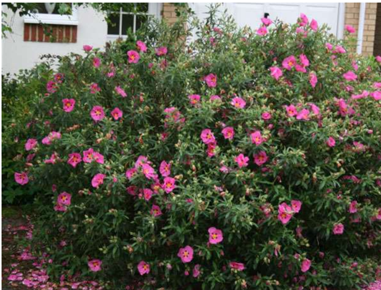
Cistus spp. Rock Rose varies