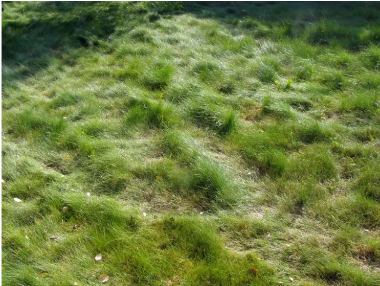
Festuca rubra Red Fescue 3