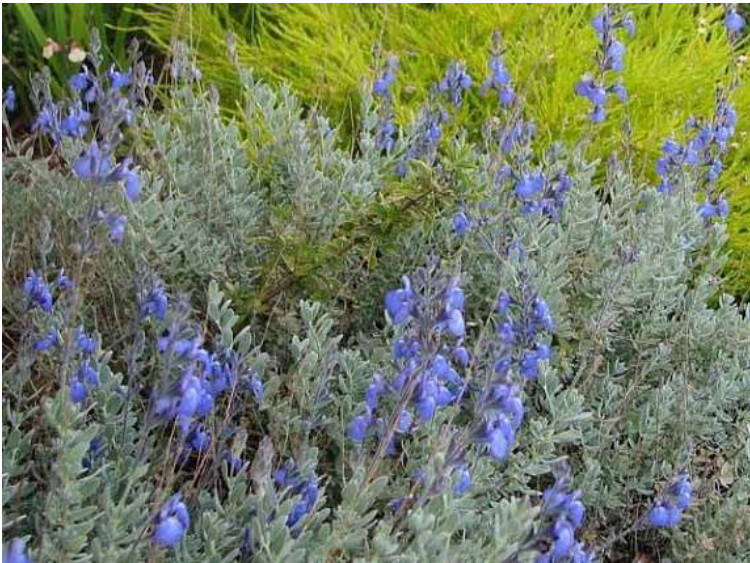
Salvia chamaedryoides Blue Sage 5