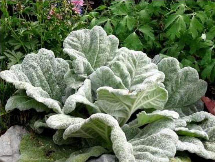
Salvia argentea Silver Sage 3