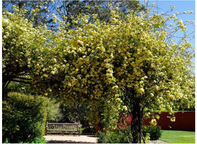
Rosa banksiae Lady Banks Rose 78