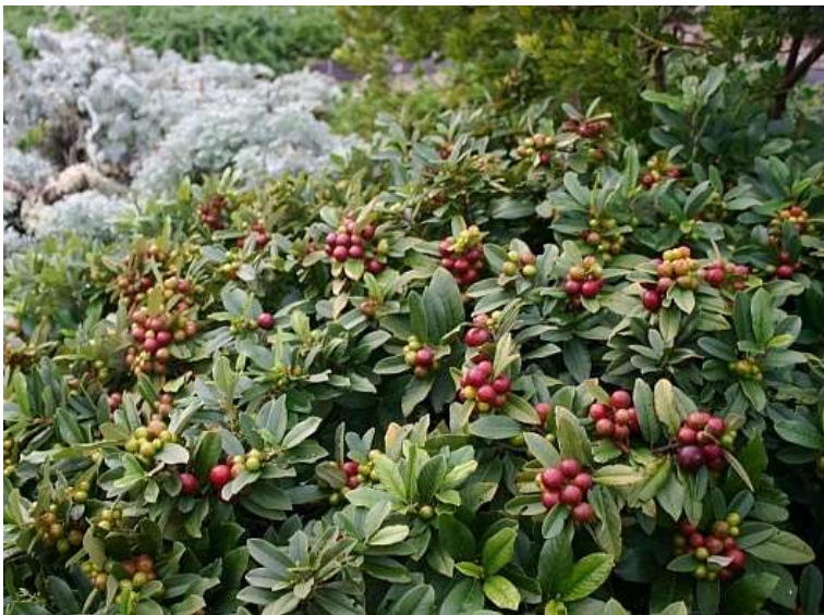
Frangula / Rhamnus californica Coffeeberry 50