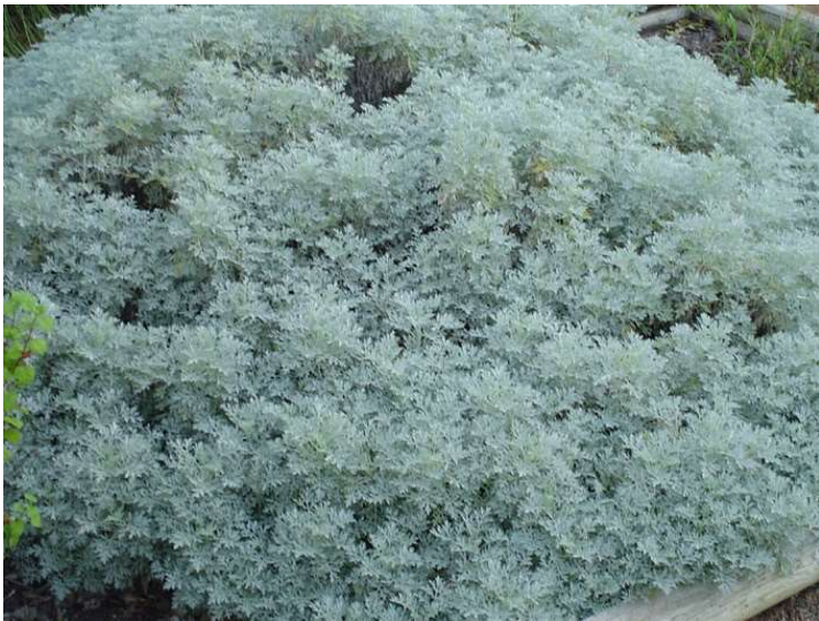
Artemisia (herbaceous) Groundcover Artemisia varies