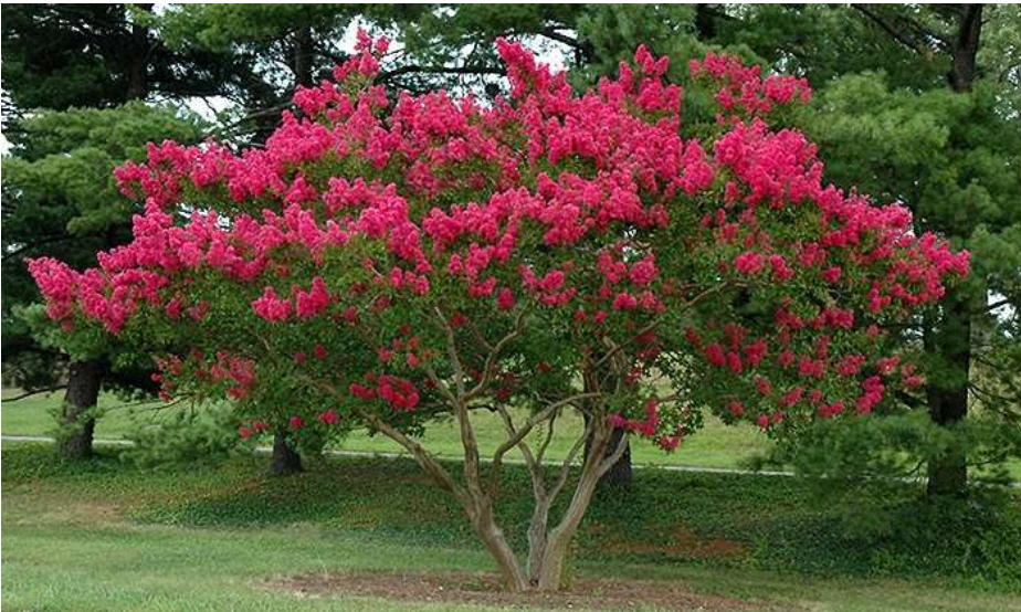
Lagerstroemia indica Crape Myrtle 189