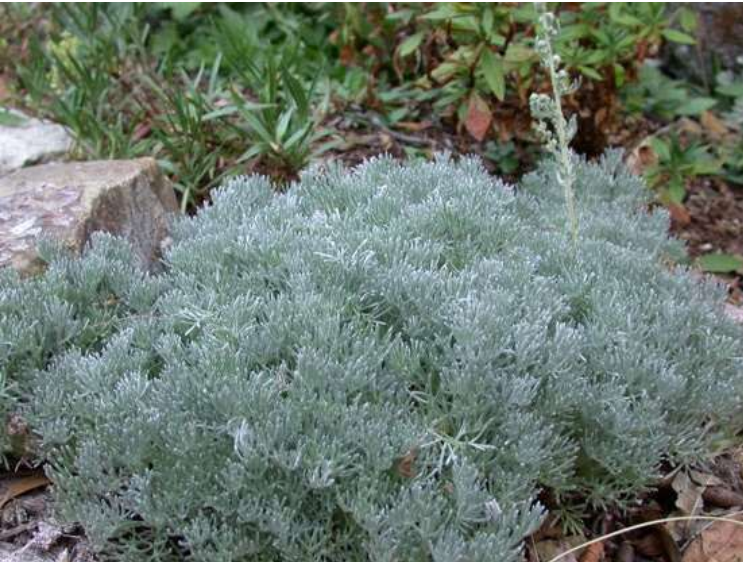
Artemisia 'David's Choice' Sagebrush 7