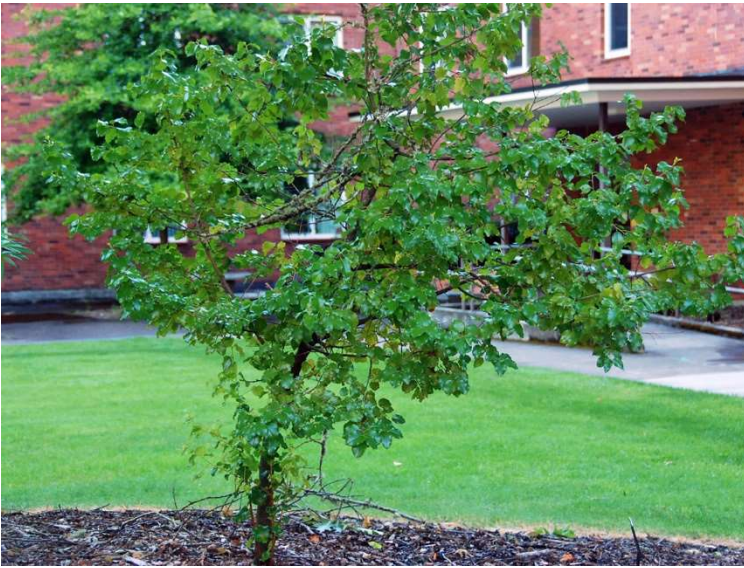
Prunus ilicifolia Holly Leaf Cherry 177