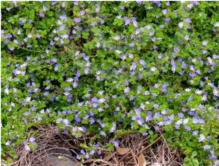
Scaevola 'Mauve Clusters' Fan Flower 13