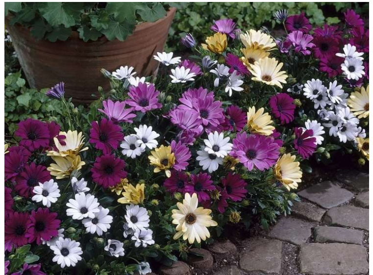
Osteospermum spp. African Daisy 3