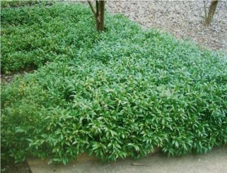
Sarcococca h. humilis Himalayan Sweet Box 50