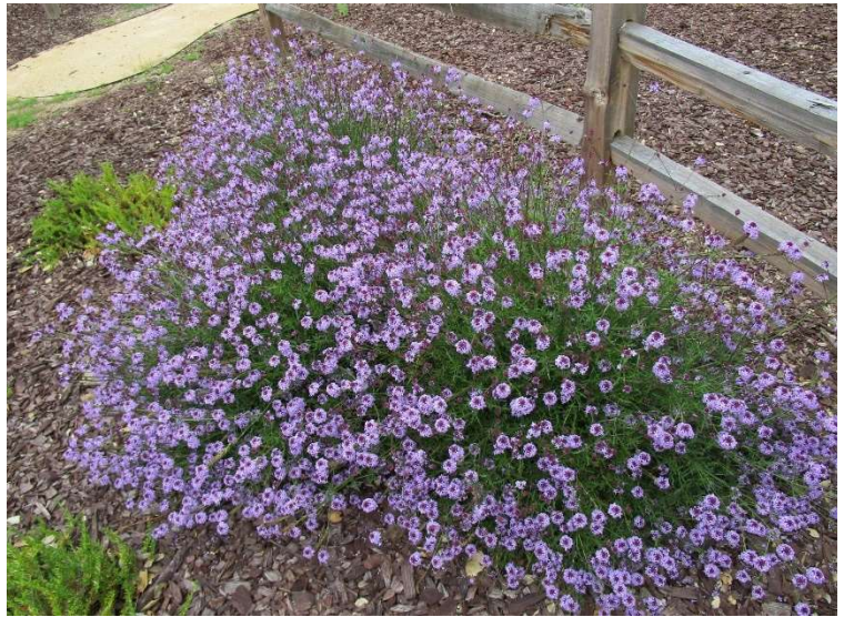
Verbena lilacina Lilac Verbena 7