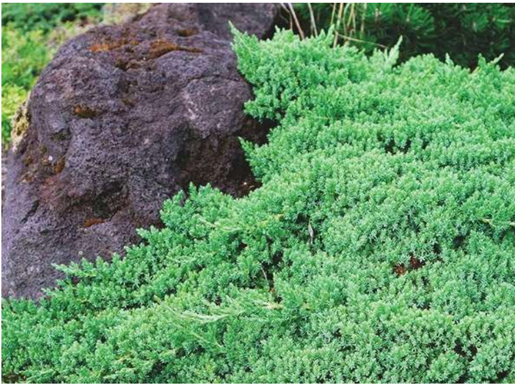
Juniperus procumbens 'Nana' Japanese Garden Juniper 16