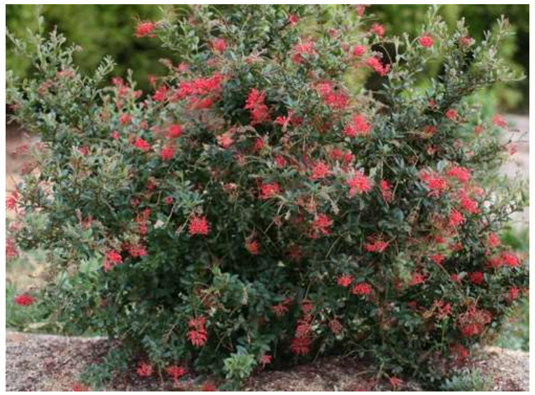
Grevillea spp. Grevillea varies