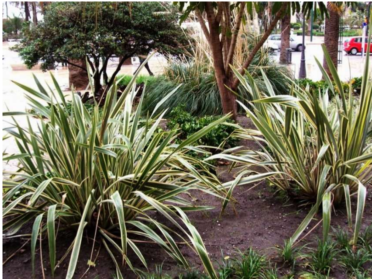
Phormium tenax New Zealand Flax 38