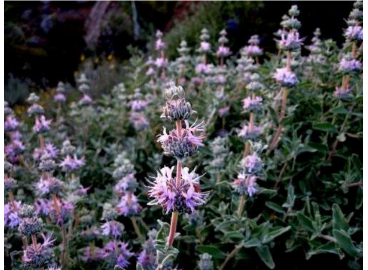
Salvia leucophylla Purple Sage 13