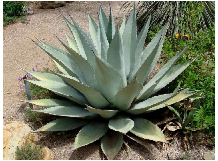
Agave spp. Agave varies