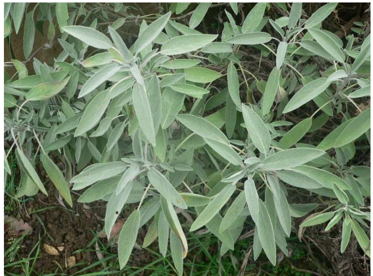
Salvia officinalis Kitchen/Garden Sage 3