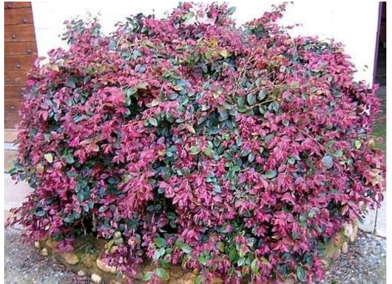
Loropetalum chinense Fringe Flower 50