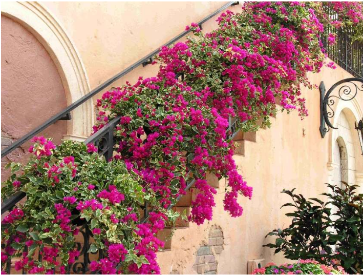
Bougainvillea spp. Bougainvillea varies