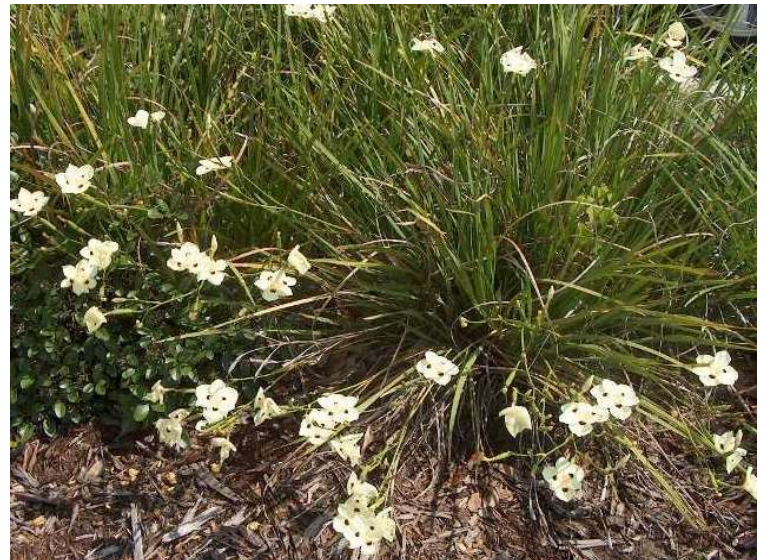
Dietes bicolor Fortnight Lily 10