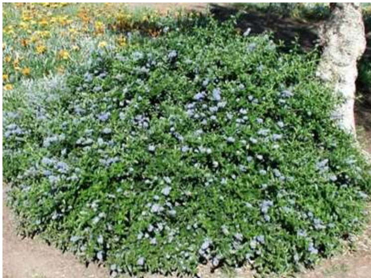
Ceanothus thyrsiflorus var. griseus 'Carmel Creeper' Carmel Creeper Ceanothus 177