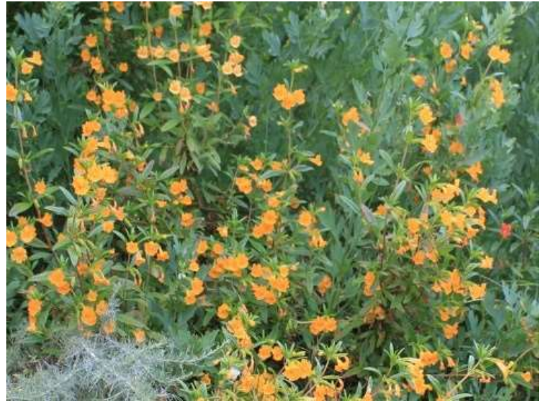
Mimulus aurantiacus Sticky Monkey Flower 7