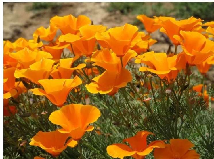
Eschscholzia californica California Poppy 1