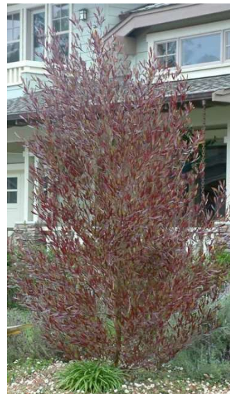
Dodonea viscosa purpurea Purple Hopseed Bush 38