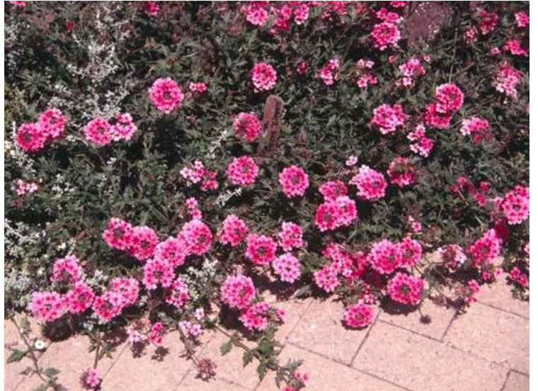
Verbena x hybrida Garden Verbena 5