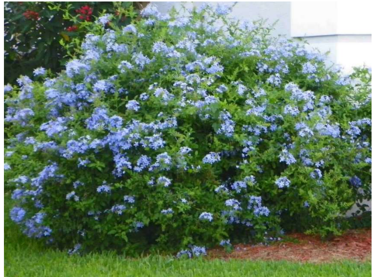
Plumbago auriculata Cape Plumbago 64