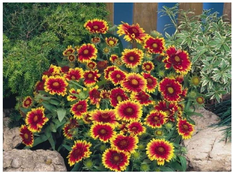
Gaillardia x grandiflora Blanket Flower 2