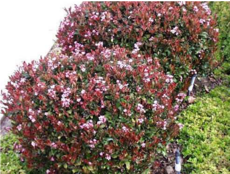
Raphiolepis indica Indian Hawthorne 24