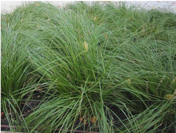
Lomandra 'Breeze' Breeze Mat Rush 9