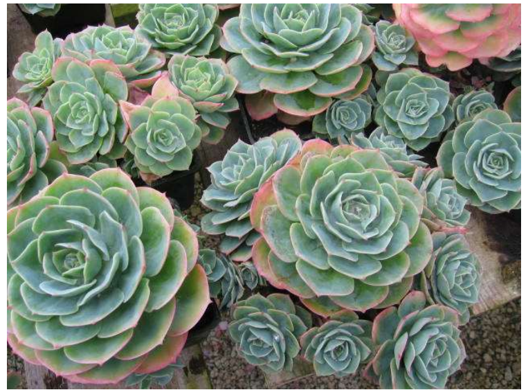
Echiveria spp. Hens and Chicks 1