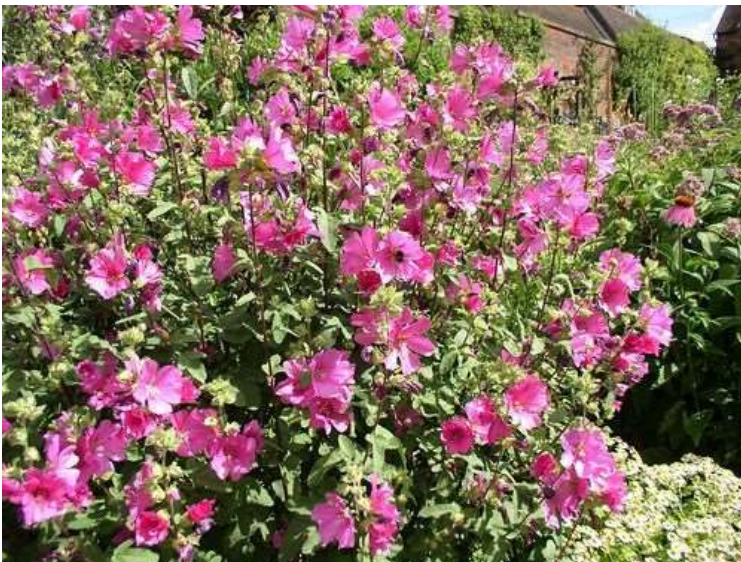
Lavatera hybrids Tree Mallow varies