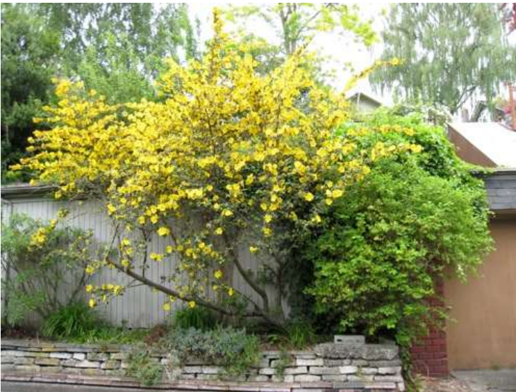
Fremontodendron Flannel Bush varies