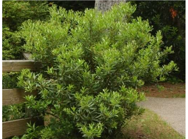
Myrica californica Pacific Wax Myrtle 177