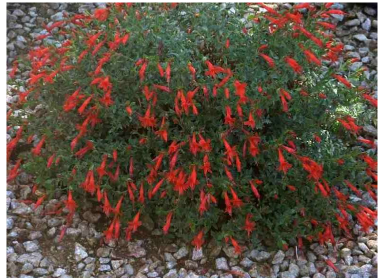
Epilobium spp. California Fuchsia varies