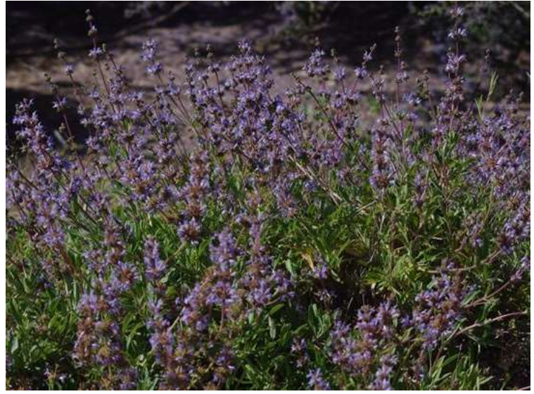
Salvia 'Dara's Choice' Sonoma Sage 16