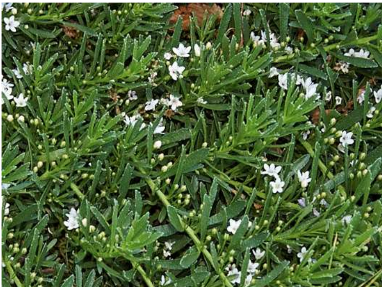
Myoporum parvifolium Myoporum 79