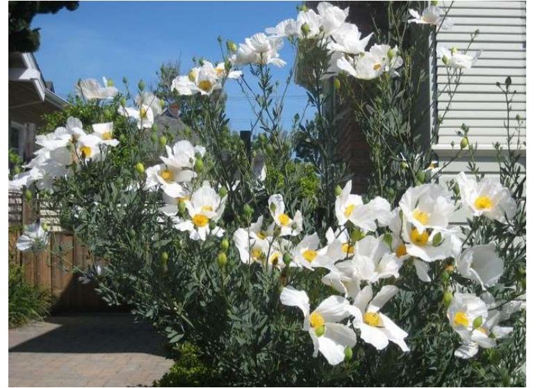
Romneya coulteri Matajilla Poppy 28