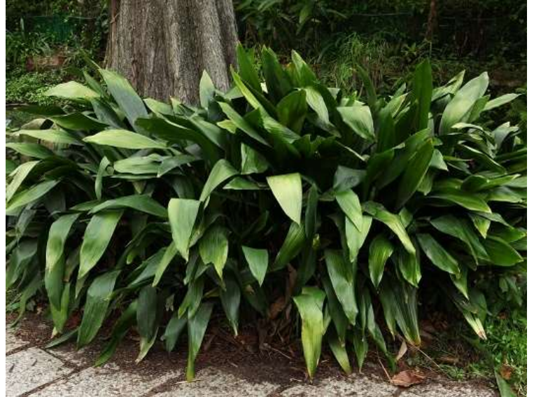
Aspidistra elatior Cast Iron Plant 2