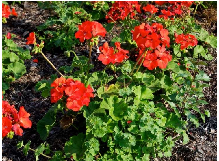
Pelargonium x hortorum Garden Geranium 7