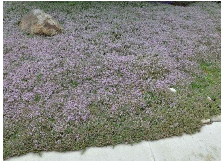
Thymus spp. Thyme 1