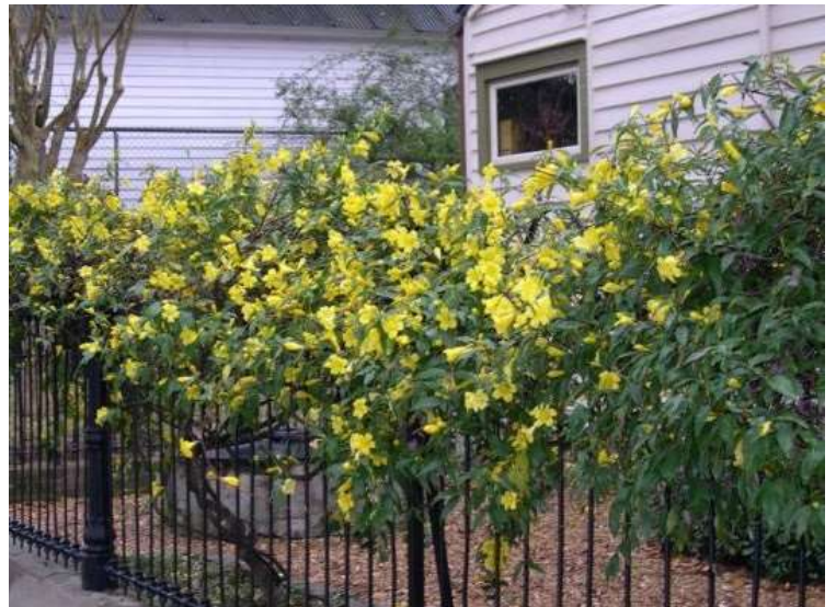
Gelsemium sempervirens Carolina Jessamine 177