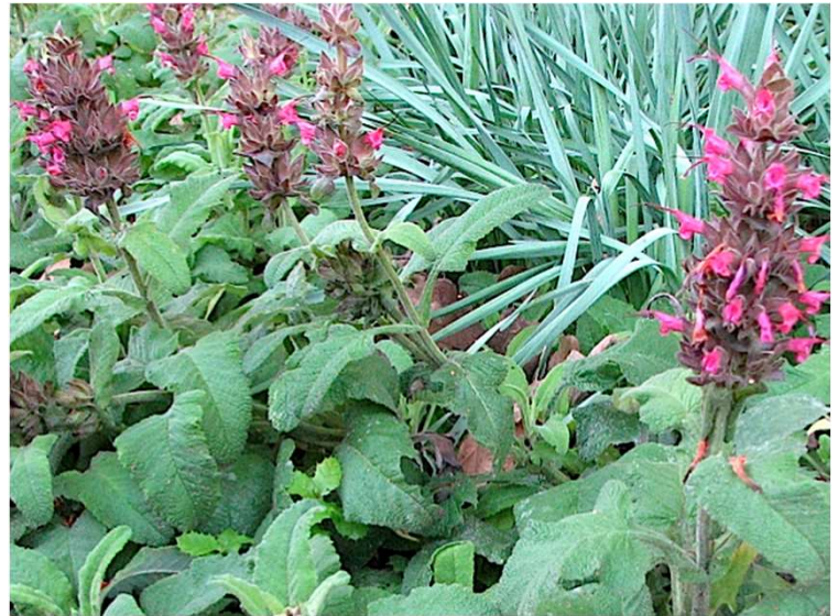
Salvia spathacea Hummingbird Sage 10