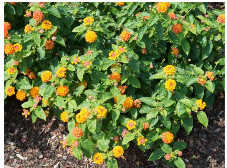
Lantana Camara Lantana 28