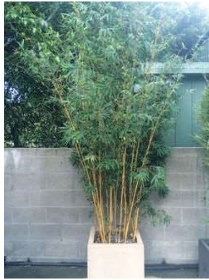
Bambusa m. 'Alphonse-Karr' Bamboo 28