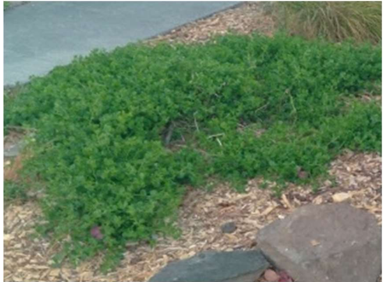
Baccharis pilularis Dwarf Coyote Bush 28