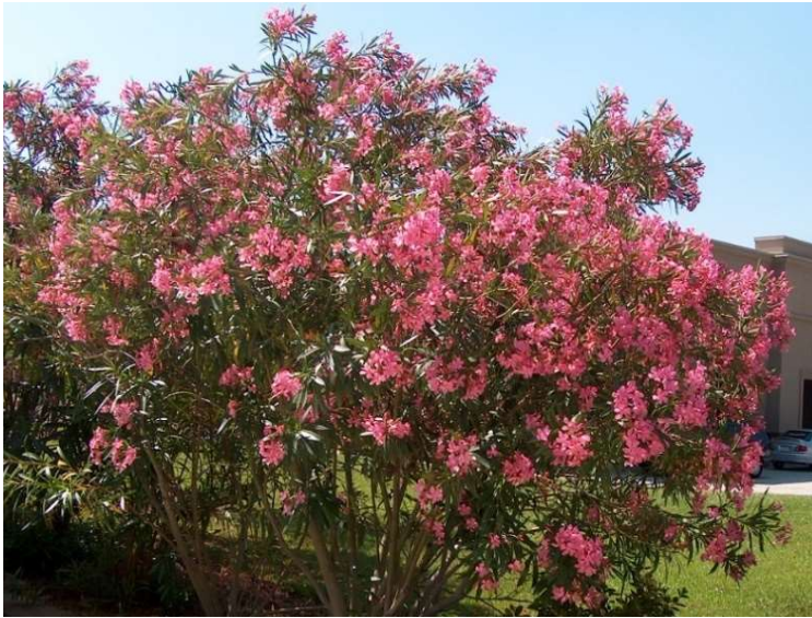
Nerium Oleander Oleander 50