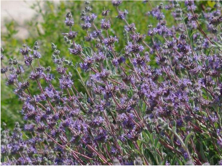
Salvia 'Bee's Bliss' Sage 28