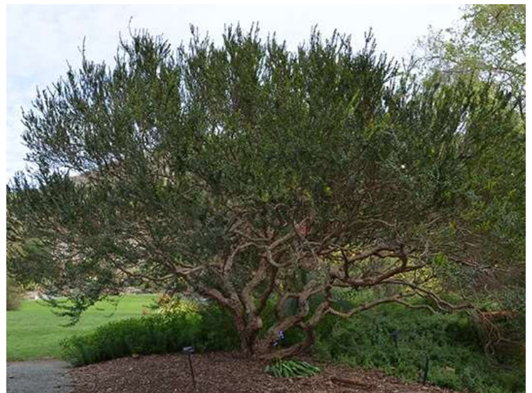
Myrtus communis True Myrtle 16