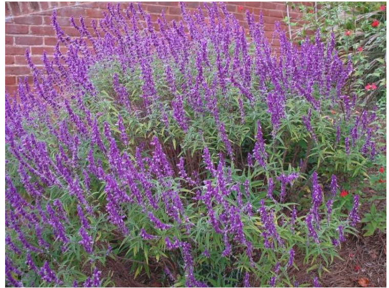
Salvia leucantha Mexican Sage 16