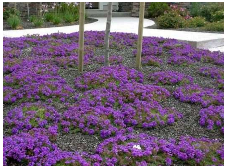
Verbena peruviana Peruvian Verbena 7