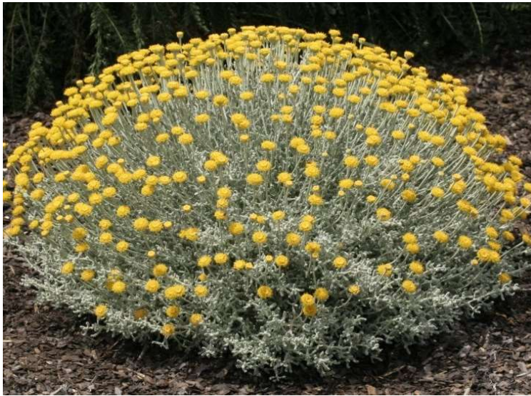
Santolina spp. Lavender Cotton varies