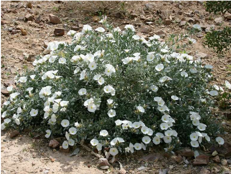
Convolvulus cneorum Bush Morning Glory 7