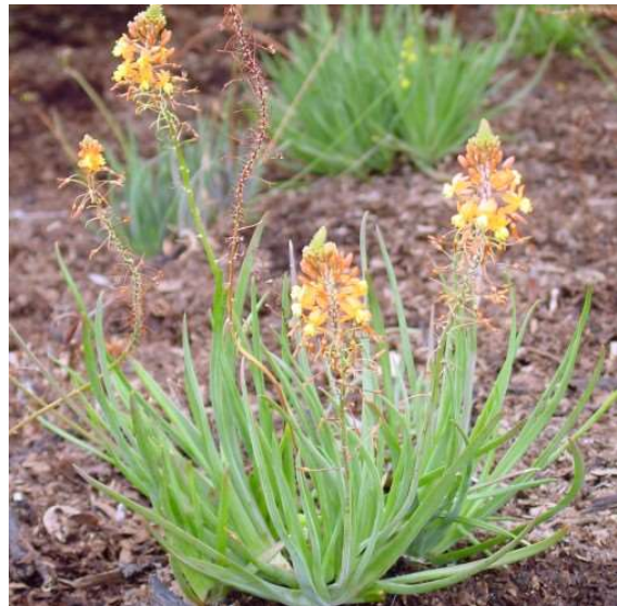
Bulbine frutescens Stalked Bulbine 5