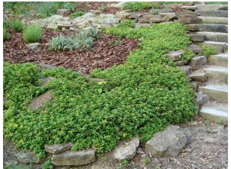
Sedum spp. Stonecrop varies