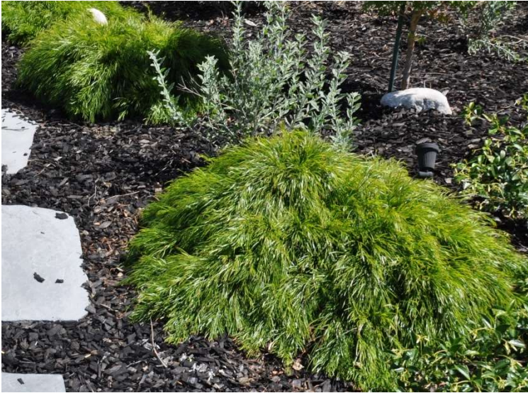
Acacia c. 'Cousin Itt' Little River Wattle 28