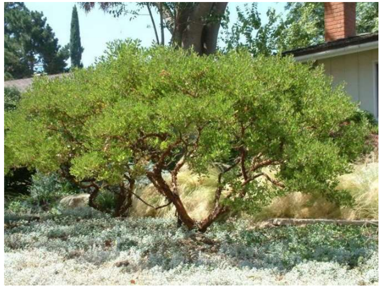
Arctostaphylos 'Howard McMinn' Manzanita 38