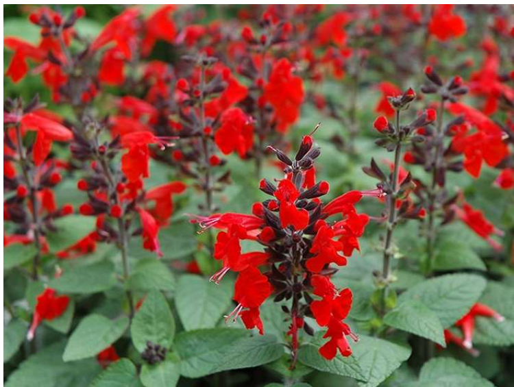
Salvia coccinea Texas Sage 5