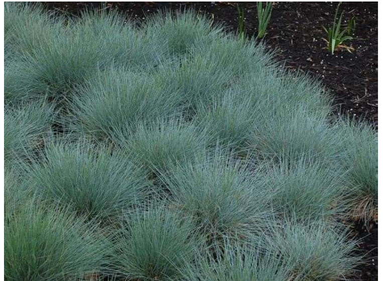
Festuca glauca Blue Fescue 1