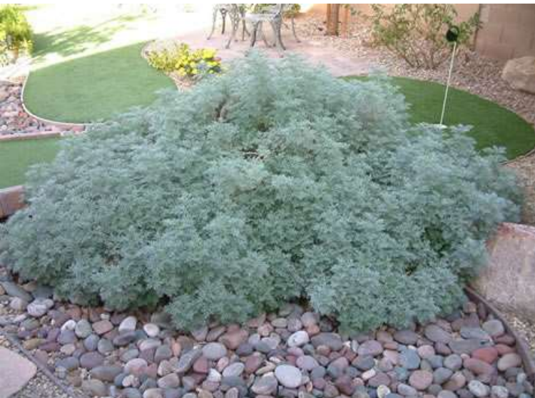
Artemisia 'Powis Castle' Sagebrush 20