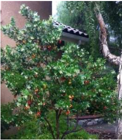
Arbutus unedo Dwarf Strawberry Tree 50