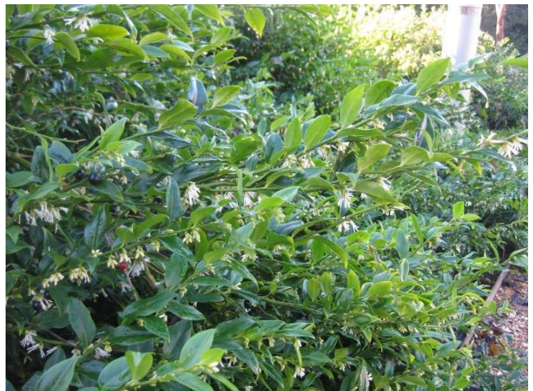
Sarcococca ruscifolia Fragrant Sarcococca 20