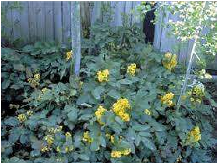
Berberis aquifolium var. repens Oregon Grape 13