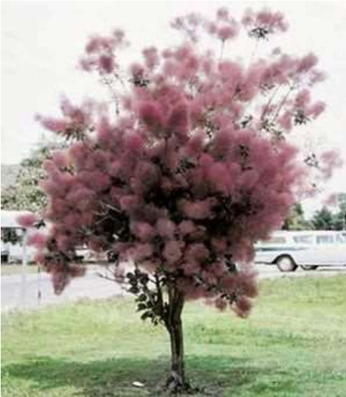
Cotinus coggygria Smoke Tree 113