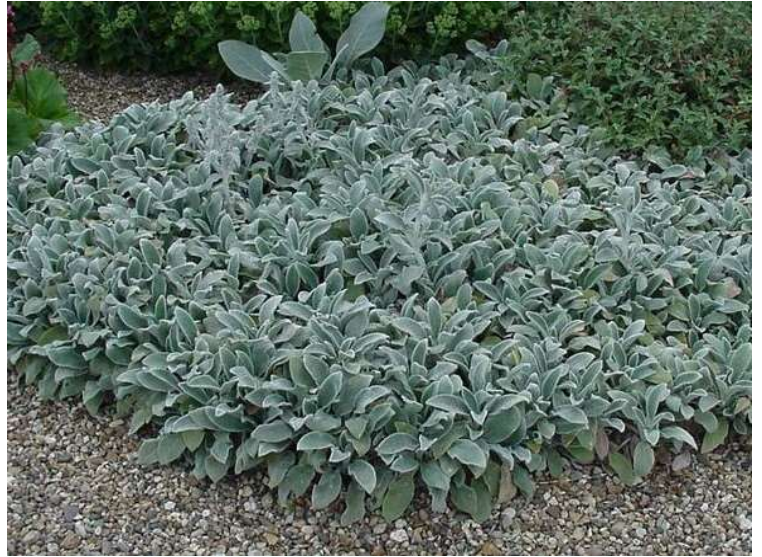
Stachys byzantina Lamb's Ear 7