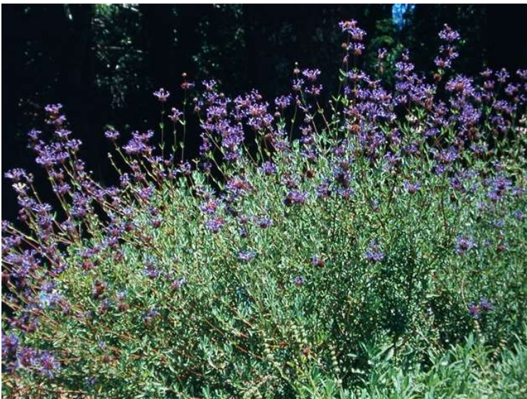
Salvia clevelandii Cleveland Sage 33