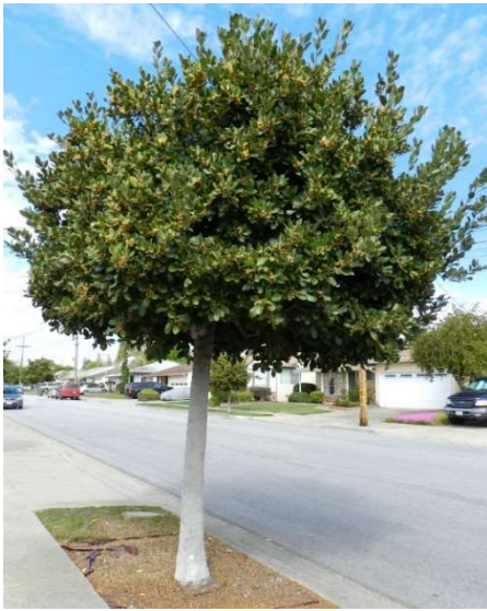
Laurus nobilis Bay Laurel 113