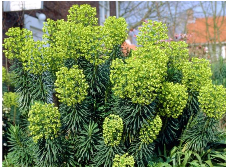
Euphorbia characias Euphorbia 13