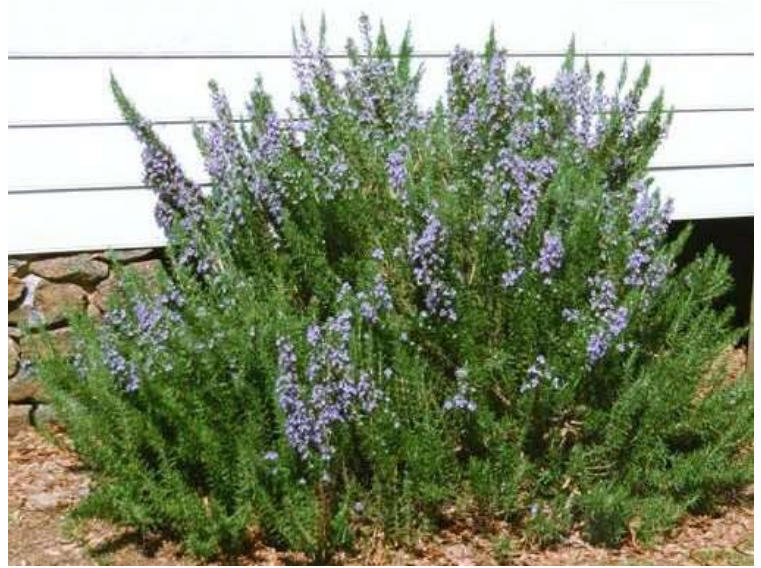
Rosmarius officinalis Rosemary 16