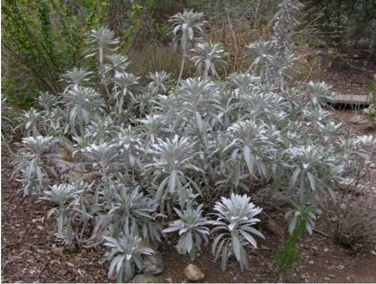
Salvia apiana White Sage 13