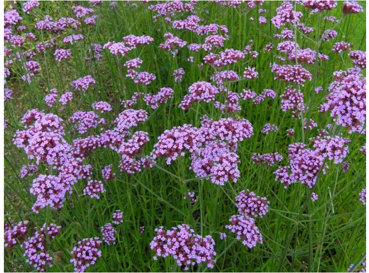
Verbena bonariensis Verbena 5