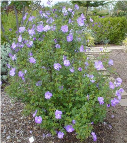
Alyogene huegelii Blue Hibiscus 28