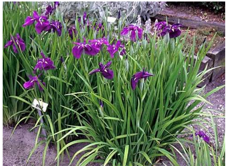
Iris spp. (some native) Iris varies