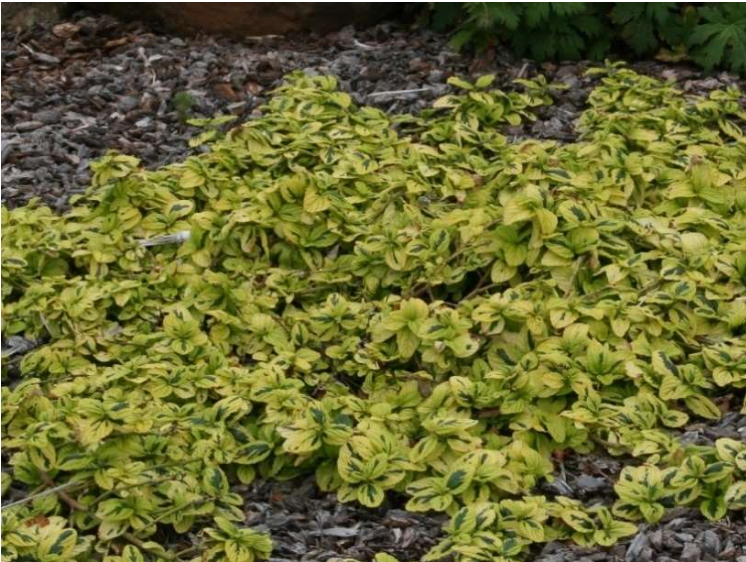
Ceanothus 'Diamond Heights' Wild Lilac 28