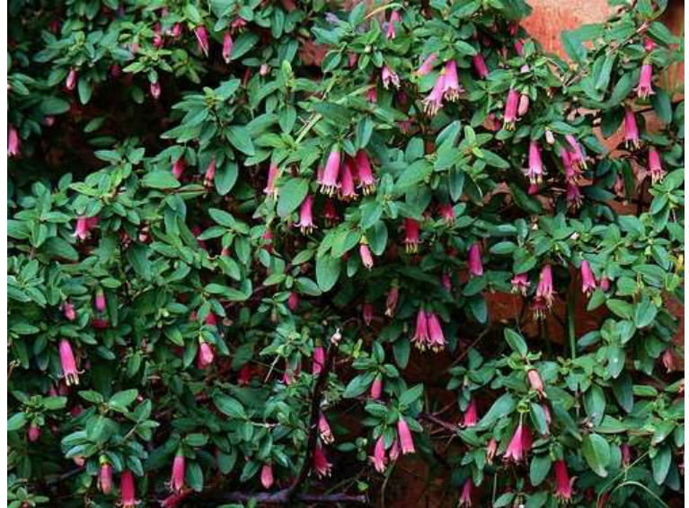
Correa spp. Australian Fuchsia varies