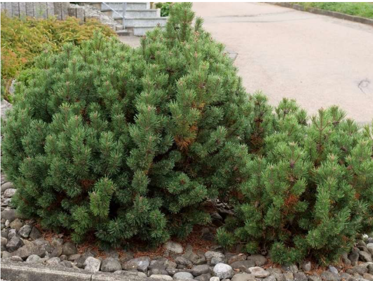
Pinus mugo Mugo Pine 104