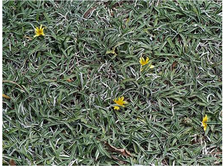
Dymondia margaretae Dymondia 30 (per flat)