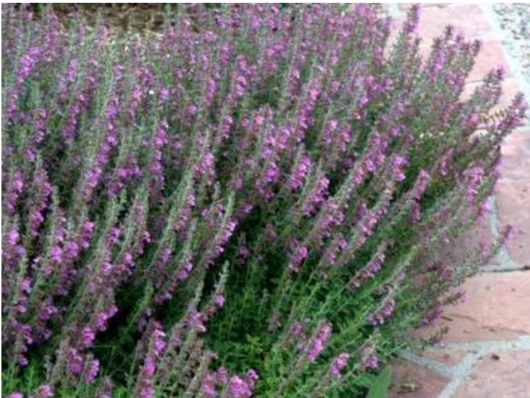
Teucrium chamaedrys Germander 3