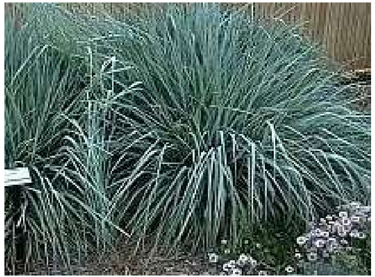
Elymus condensatus Giant Wild Rye 20