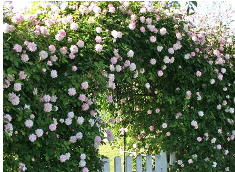
Rosa 'Cecile Brunner' Climbing Rose 95