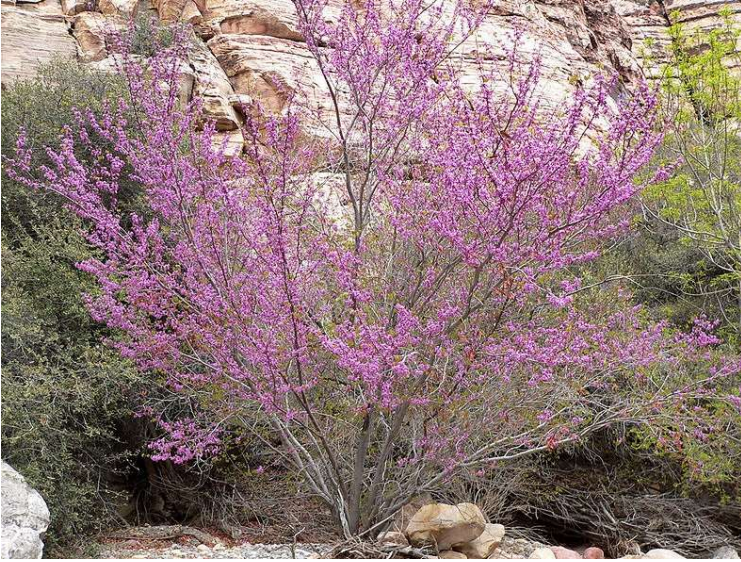
Cercis occidentalis Western Redbud 79