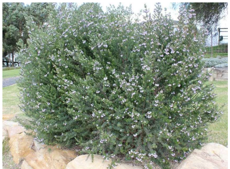
Westringia fruitcosa Coast Rosemary 44