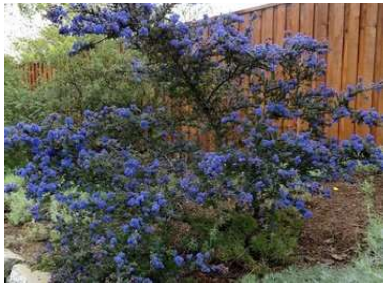
Ceanothus 'Dark Star' Wild Lilac 28