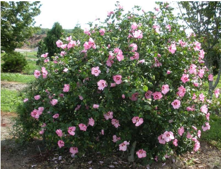
Hibiscus syriacus Rose of Sharon 28