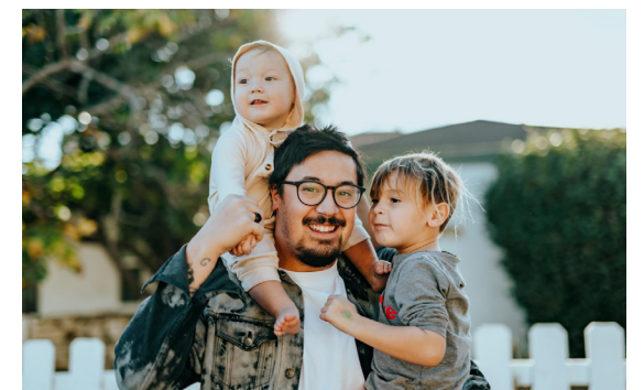
Financial Rate Assistance

Silicon Valley Power understands the economic pressures on its customers due to inflation and rising energy costs. To help financially vulnerable customers, the utility offers a Financial Rate Assistance Program (FRAP) to provide a discount on the electric bill for all eligible customers. The program is tiered to provide the most help to customers who earn the least amount of money. Discounts range from 25–40%, depending on income eligibility. To apply for the Financial Rate Assistance Program, visit SiliconValleyPower.com/Assist . For questions, please call our Energy Conservation Hotline at 408-244-SAVE (7283).