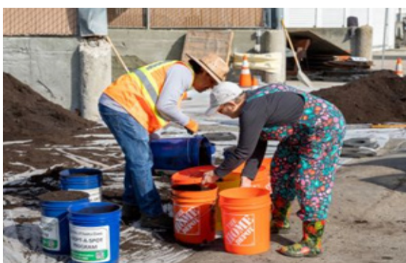
Free Compost Giveaway

For more information, contact the Department of Public Works at Environment@SantaClaraCA.gov or 408-615-3080.