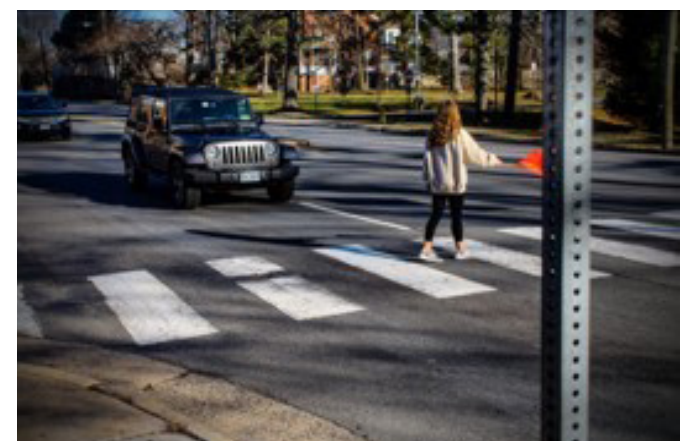
Crosswalk Flags Pilot Project

The City of Santa Clara will launch a pilot program in early March 2024 to evaluate the effectiveness of pedestrians using brightly colored flags when moving through marked crosswalks. The flags intend to raise driver awareness of pedestrians using crosswalks and to increase pedestrian safety. These flags are not formal traffic control devices. Under the pilot program, pedestrian crossing flags will be placed at 25 high-priority uncontrolled crosswalks in the City where pedestrians encounter crossing challenges. The pilot program will last approximately 12 months. For more information about this program, visit the program webpage .