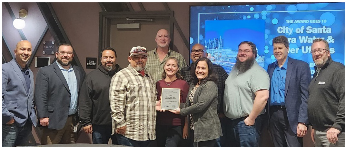
Water & Sewer Utilities Awarded Collection System of the Year