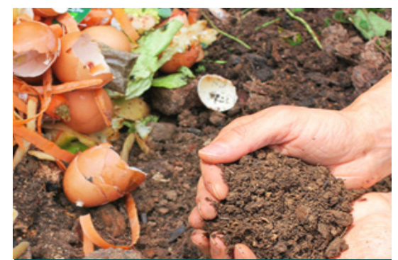
Backyard Composting Workshop

Reduce your carbon footprint and recycle your organic waste by composting at home. Register for a composting basics workshop on Saturday, March 9, 10 a.m. – 12 p.m. , at the Everett N. "Eddie" Souza Park located at 2380 Monroe Street. Learn how to build and maintain a home compost bin and apply the finished compost. This workshop will focus on backyard composting of yard trimmings and food scraps.