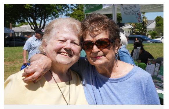
"Be Strong, Live Long" Health & Wellness Fair