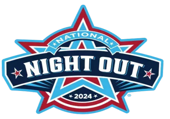
POLICE · COMMUNITY PARTNERSHIPS

Pollution prevention starts at our front doors. Trash can travel through storm drains, creeks, and rivers to become bay pollution that is harmful to wildlife. Participate with other volunteers to help keep our ecosystems and waterways free from trash. The City of Santa Clara will host two cleanup sites on Saturday , May 18, 9 a.m. – 12 p.m. Register for the cleanup and help be the solution to water pollution! Visit <u>cleanacreek.org</u> for more information and to register.