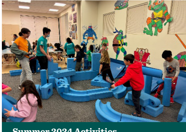
Summer 2024 Activities

your swimming strokes, we have the perfect class or camp just for you. The Summer 2024 Activity Guide is available online and registration is underway. The adventures begin the week of June 3. Visit <u>SantaClaraCA.gov/RecClasses</u> for more information.