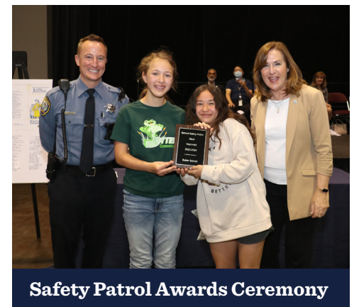
Safety Patrol Awards Ceremony