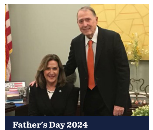
Father's Day 2024