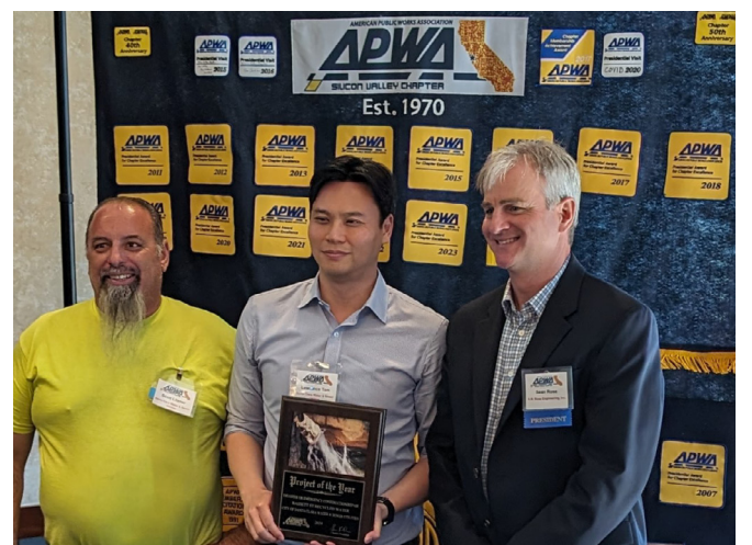
Bassett Street recycled water APWA award