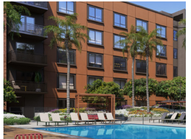
Affordable Housing at Orlo Apartment

There are 32 affordable housing rental units available at Orlo in Santa Clara located at 1200 Rickabaugh Way. There are studios, 1, 2 or 3 bedroom apartments available via lottery with applications being accepted May 20 to June 26. Preference will be given to those who live or work within the City of Santa Clara city limits. Information regarding eligibility requirements and application is available online .