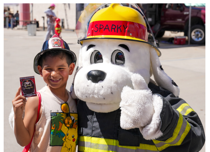
Firehouse Community Fair