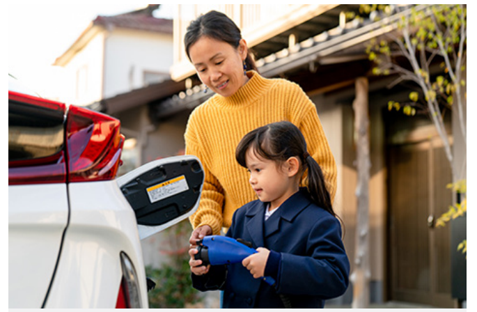
Income-qualified rebates on pre-owned electric vehicles

On May 11, Santa Clara Fire Department welcomed approximately 1000 guests to the SCFD Training Center/Drill Grounds for the Firehouse Community Fair! Visitors were treated to live demonstrations including auto extrication, aerial ladder rescue, live fire extinguisher, and search dog demos. Children were invited to explore different kids' agility courses, flow water through fire hose, practice CPR and Stop/Drop/Roll, and learn about fire safety. Several First Responder Therapy Dogs were on hand for furry cuddles; and the SCFD Museum offered a journey through firefighting history. Mission College students from the Fire Academy, EMT, and Fire Science programs volunteered their time and energy to assist the Santa Clara Fire Department team, making this community event a fun, informative and successful time for all!