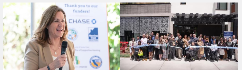
Kifer Senior Apartments Grand Opening

It was my honor to help officiate at the ribbon-cutting for the Kifer Senior Apartment project in Santa Clara, located at 3333 Kifer Road. These new 80 units are designed for adults, 55 and over. Warm thanks to everyone who helped bring this project to fruition. Santa Clara welcomes all and remains committed to providing affordable housing options for those in need.