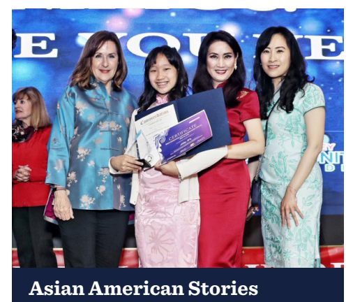
Asian American Stories

I was honored to serve as one of the many judges who viewed 72 video submissions. Congratulations to all the video winners and a special thanks to the entire committee for their commitment to lifting Asian American voices, standing against discrimination, and stopping Asian hate. Once again, I was reminded through all the spectacular story submittals and performances that "ALL OF US BELONG RIGHT HERE". To watch the videos and for more information on next year's contest, visit aastories.org