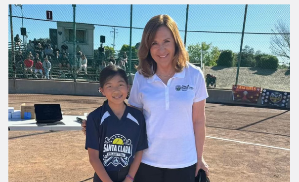
Santa Clara Pal Softball