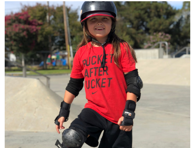
Skateboarding Camps in July

We are excited to offer skateboarding camps for ages 4–9 years and 7–15 years old throughout the month of July. SKATEKAMP skateboarding camps are for first-time, beginner and current skaters alike. Participants will safely learn to skateboard at their own pace, make new friends during fun group activities, and build self-confidence. To register, visit SantaClaraCA.gov/ActiveNet .