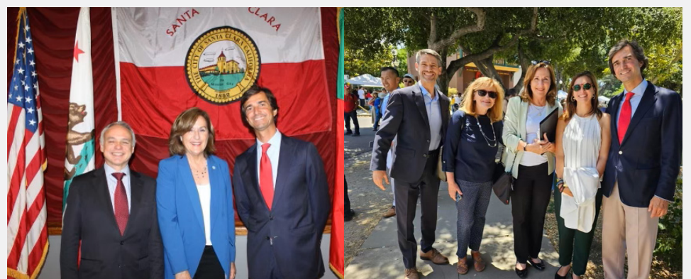
Portuguese National Heritage Month

Living in a multi-cultural community has numerous benefits. We are so fortunate to be blessed with our Portuguese community in Santa Clara. The Portuguese community has played a significant role in the development and growth of our city since its creation. Their cultural influence can be seen in various aspects of our community, from food and festivals to architecture and traditions.