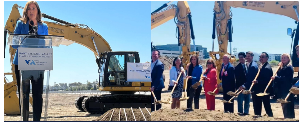
BART Silicon Valley Phase II West Portal Groundbreaking