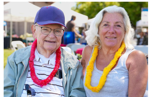
Fall Recreation Coming Soon

Registration for Parks & Recreation Programs and Classes opens on Tuesday, July 23 at 7 a.m. This is a great opportunity to take a fitness class, explore a new hobby with ceramics, silk painting and swimming or enroll the kiddos in a fall recreation class like dance, arts & crafts or theater. Visit SantaClaraCA.gov/RecClasses for more information.