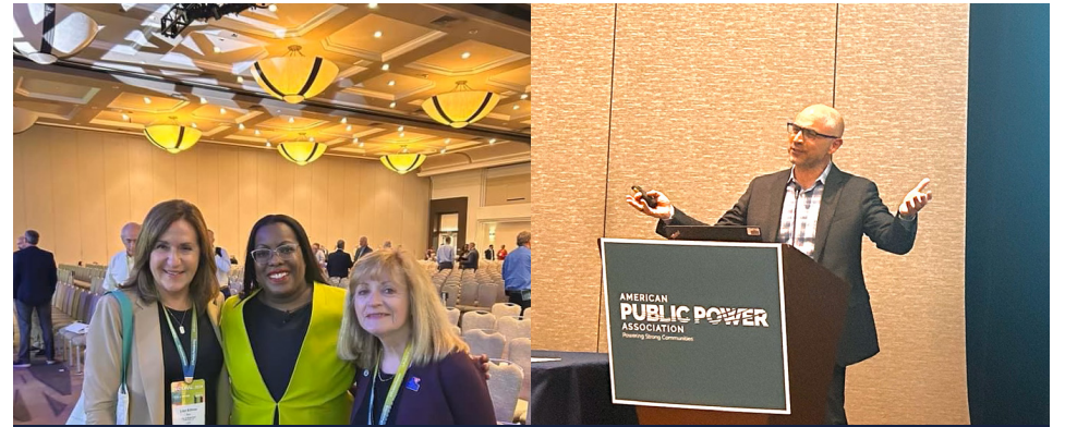
APPA Public Power Conference