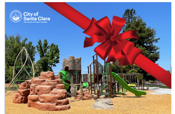
Westwood Oaks Playground Ribbon-Cutting Ceremony

The Westwood Oaks Playground has undergone a fantastic transformation. Join the Mayor, City Council, Parks & Recreation Commissioners and the community in a Ribbon-Cutting Ceremony to celebrate the reopening of Westwood Oaks Park. The event will take place on Wednesday, July 10, 2024 at 10 a.m. at 460 La Herran Drive. Light refreshments will be provided.