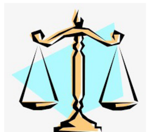
Ethics, Accountability, and Integrity