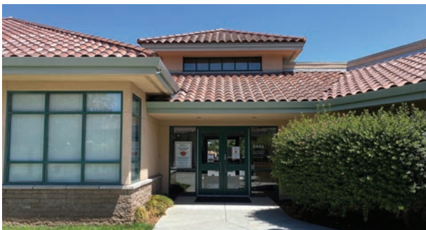
YOUTH & TEEN CENTER

Learn more at SantaClaraCA.gov/SeniorCenter