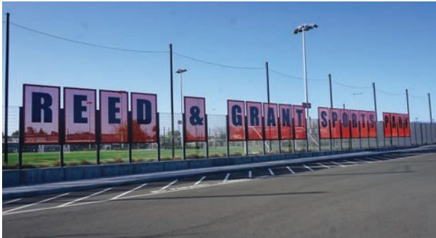
REED & GRANT SPORTS PARK