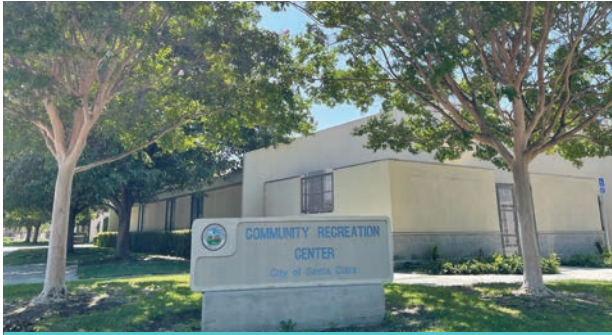
COMMUNITY RECREATION CENTER