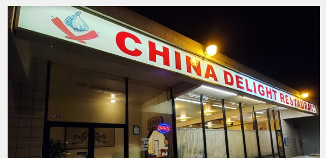
Eatery of the Month: China Delight

The hardworking owners and chefs make for a memorable meal. They have dine-in and to-go options. My favorites at China Delight are the "Sizzling Rice Soup", "Mongolian Beef" and the "Mu Shu Pork with extra pancakes and plum sauce". Santa Clarans should make an order at this great District 6 Eatery.