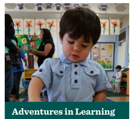
Adventures in Learning

New classes are forming for this play-based program encourages social development through group activities and play. Teachers focus on building confidence, encouraging exploration and creative learning each day through circle time, craft, songs, story time, indoor and outdoor play activities which are essential in the development of social, fine and gross motor skills, and much more. Visit SantaClaraCA.gov/AIL or call 408-615-3140 for more information.