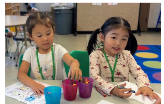
Adventures in Learning

Enroll your child today for the 2024-2025 school year! This fantastic program designed for children ages 3-5, offers a blend of entertainment and development of social and motor skills through interactive play, crafty activities, and educational components. From circle time to creative arts, lively music, storytelling, and plenty of playtime – each day is full of new experiences that will allow your child to flourish in a nurturing and joyful environment. Visit SantaClaraCA.gov/AIL for more information or to schedule a tour today!