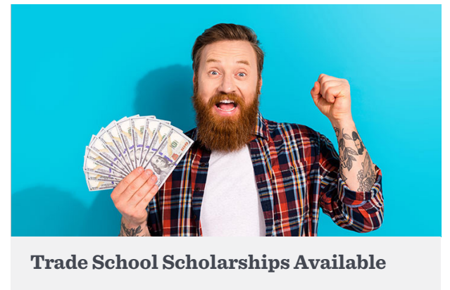
Trade School Scholarships Available

Does your family have a household communication plan? Make an emergency plan today and practice it! During a local emergency, receive alerts to your mobile, landline or email for fire, earthquake, severe weather, crime activity, and instructions during a disaster. Alert SCC is Santa Clara County's emergency alert and warning system. Sign up today for free at AlertSCC.org . For emergency preparedness tips, visit SantaClaraCA.gov/EmergencyPreparedness .