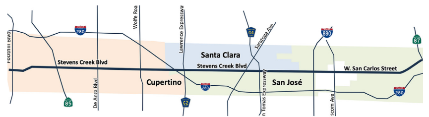
Proposed Starbucks on Stevens Creek Boulevard

As previously mentioned in my prior newsletters that there is a proposed Starbucks project in southern District 6 at Stevens Creek Boulevard and Harold Avenue. The project has received lots of community feedback.