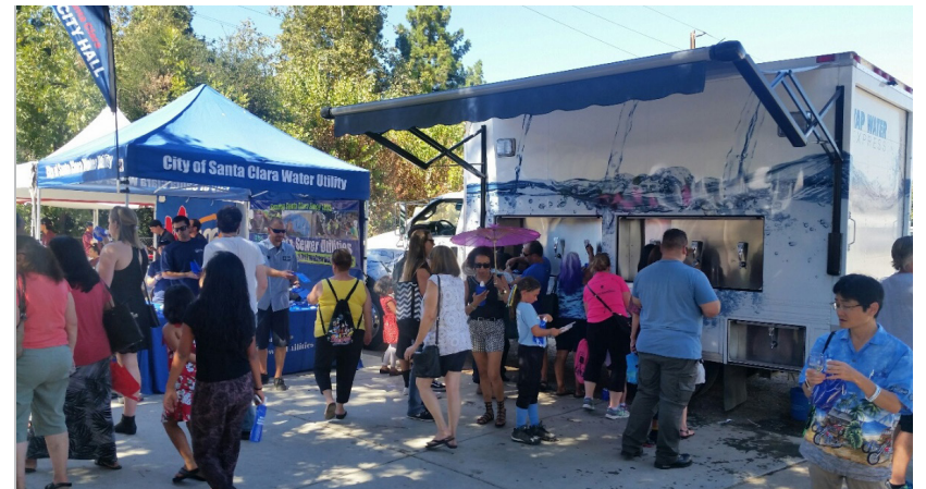
Santa Clara Tap Water Express