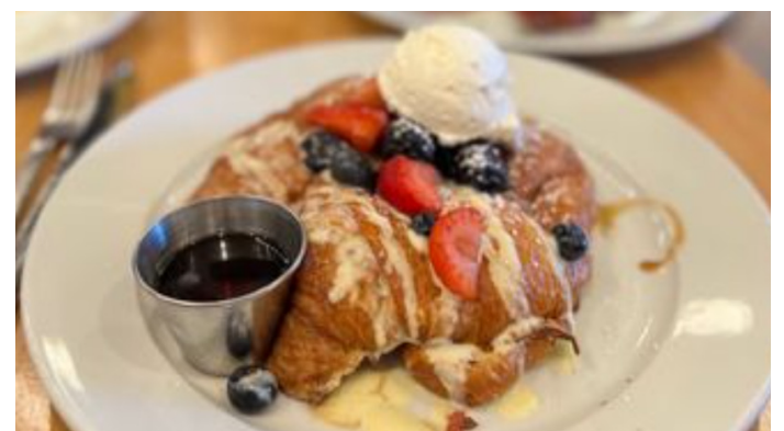
Eatery of the Month: Bloom Eatery & Spirits

For September, I selected Bloom: Eatery & Spirits located at 202 Saratoga Ave. Bloom first opened its doors in the middle of the pandemic in 2020. Looking back, Bloom became a beacon for to-go orders when in-dining was prohibited, since then in-person dining returned. Where most businesses struggled to rebound from the pandemic, Bloom thrived. I have watched this eating establishment grow in popularity and see lines to get a seat on Saturday and Sunday mornings. Their hours of operation are Wednesday through Sunday 8 a.m. till 2:30 p.m..