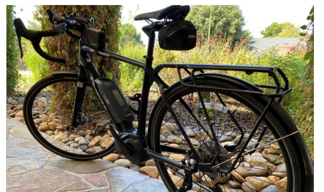
Electric Bicycle Rebates Available

E-bikes are great for those who want to commute or run errands on a bicycle but want to travel faster or need extra assistance. There are many options to choose from so everyone can find the right e-bike for their needs. For complete program details, visit SiliconValleyPower.com/Rebates .